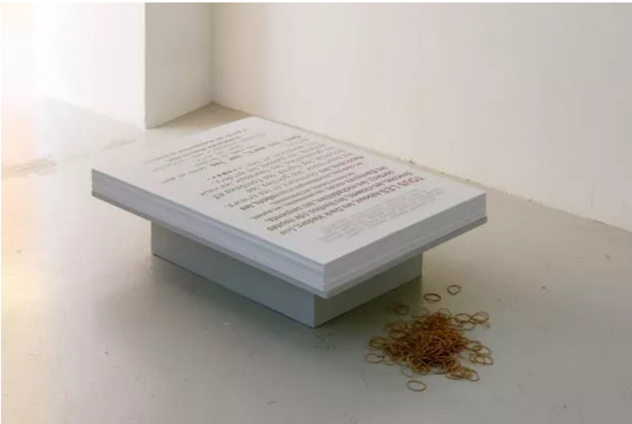
Exhibition view at Le Quartier, Quimper.