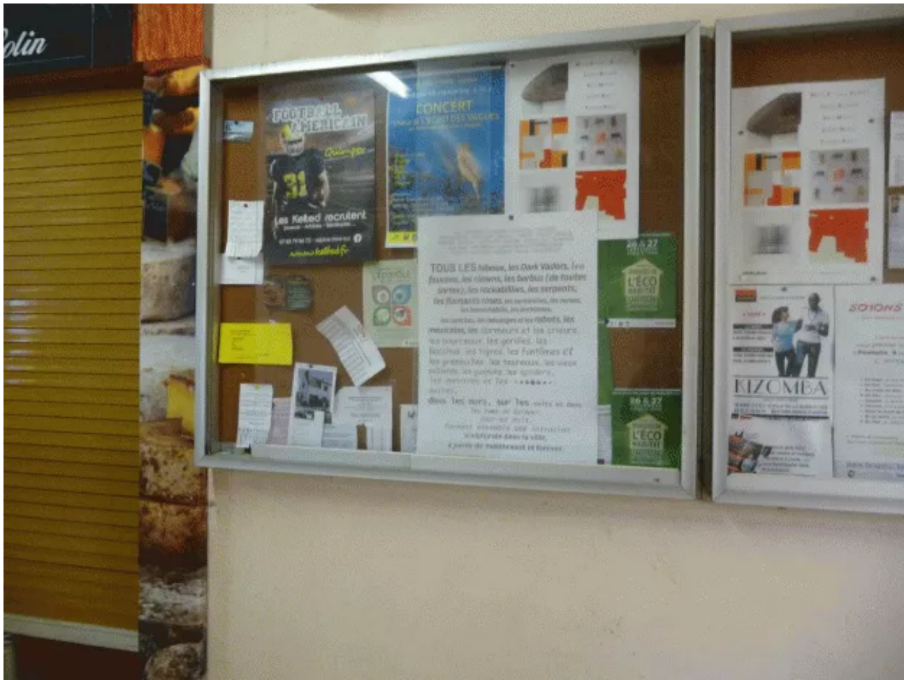
At the market, Quimper.