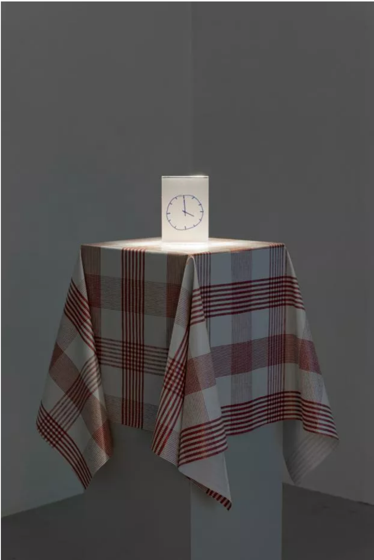
Exhibition view before 4 p.m. at Le Quartier, Quimper.