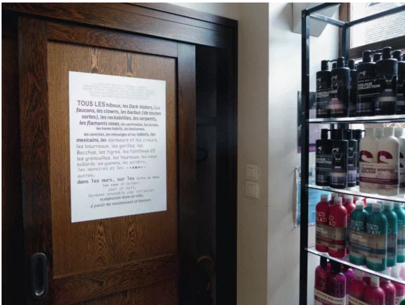
In a barbershop, Quimper.