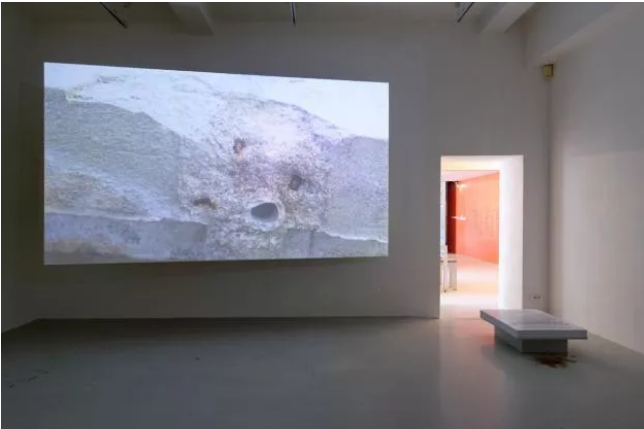
Exhibition view at Le Quartier, Quimper.