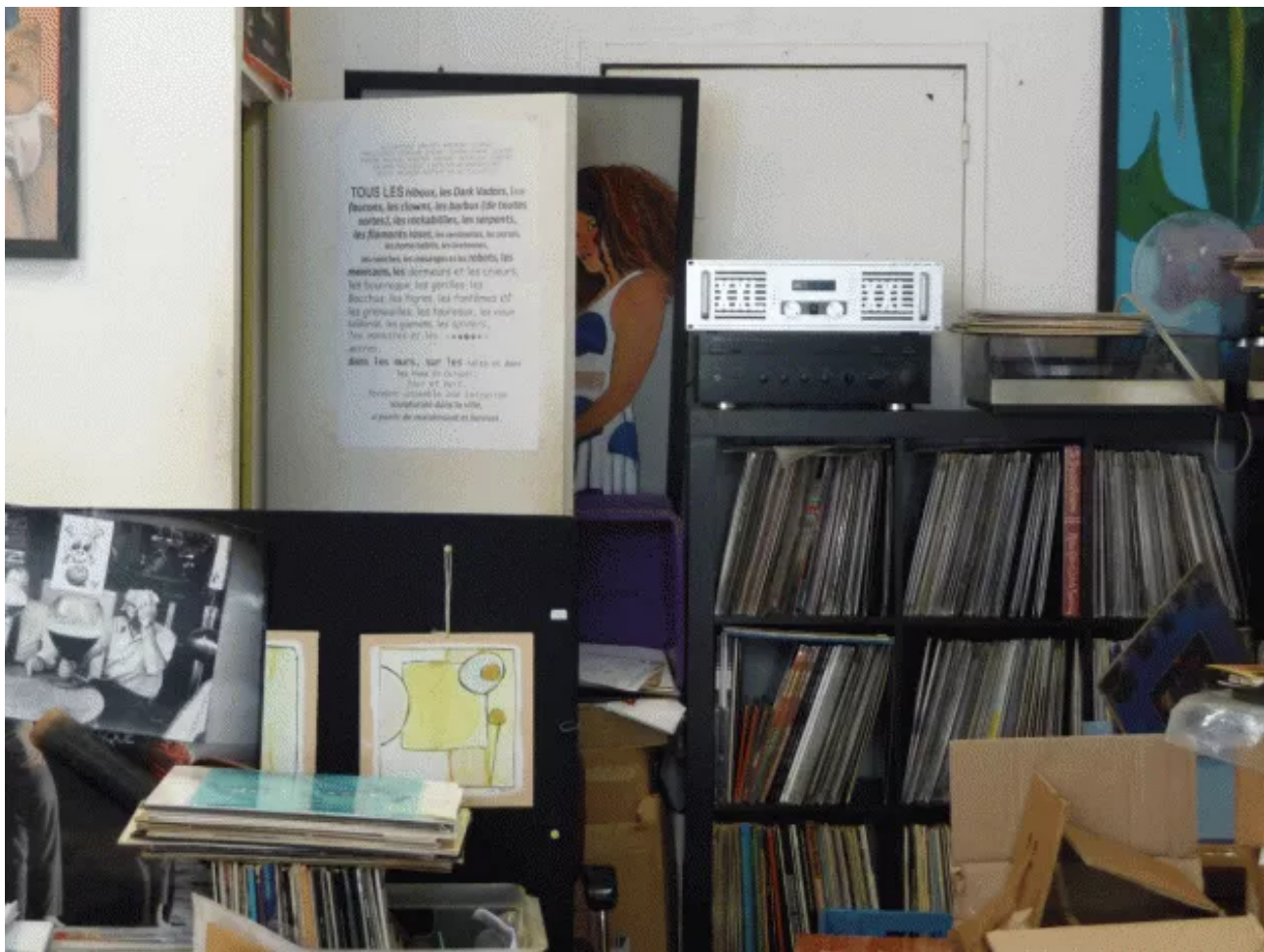
In a music store, Quimper.