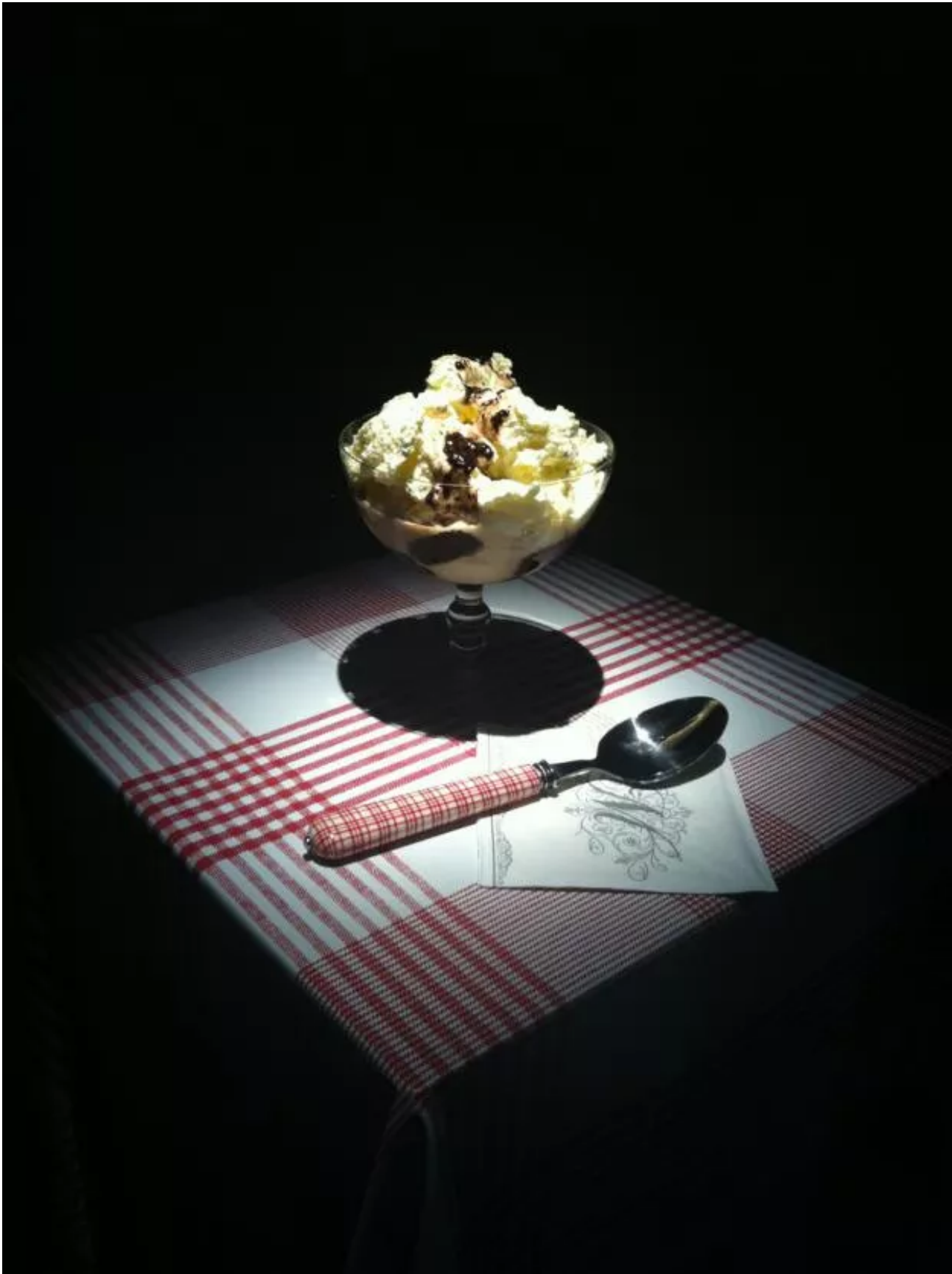
Exhibition view slightly after 4 p.m. at Le Quartier, Quimper.