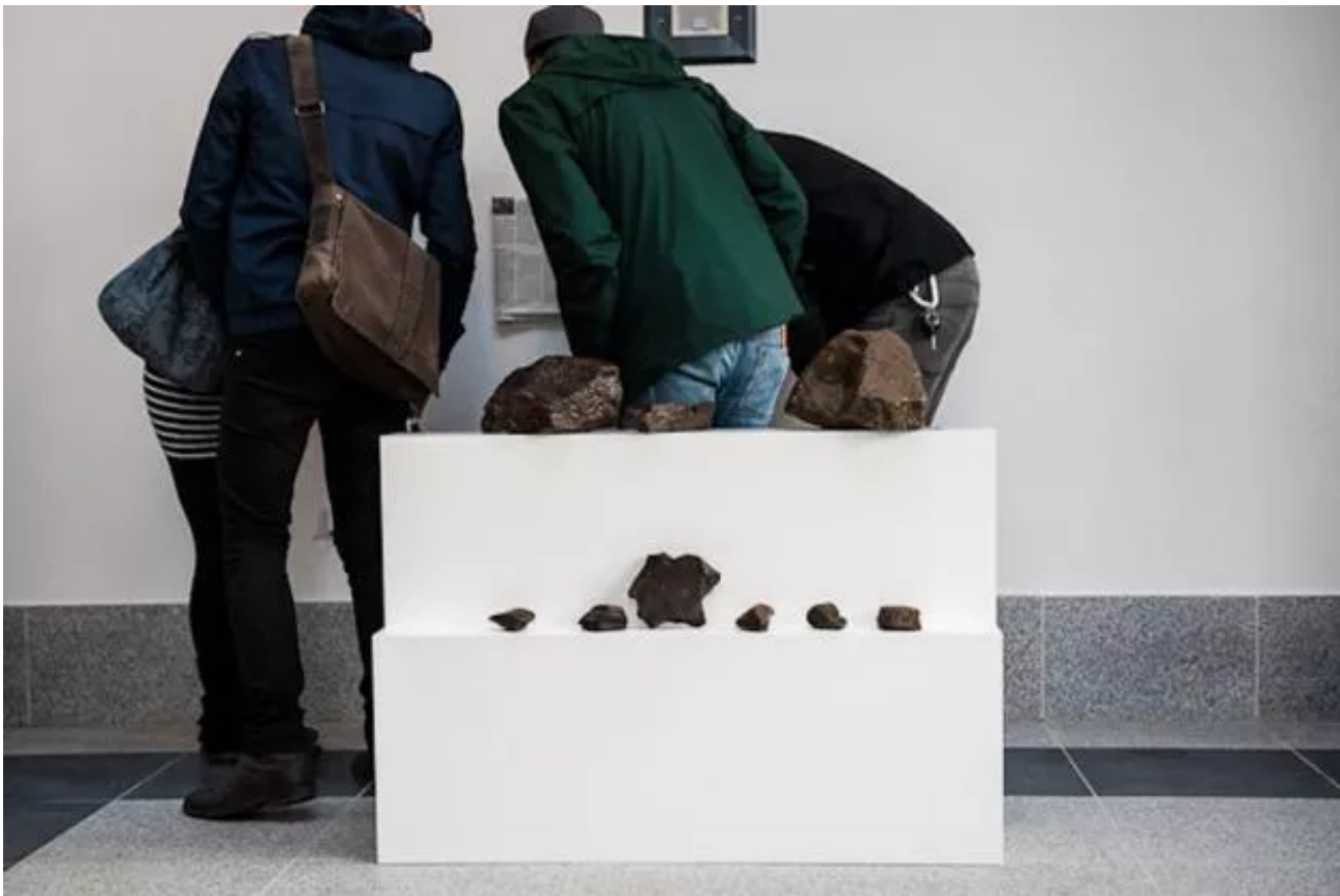
Performance during the opening of the exhibition WAS WIR WOLLEN curated by ff. Konzeptzuaktuellerkunst, Dresden.