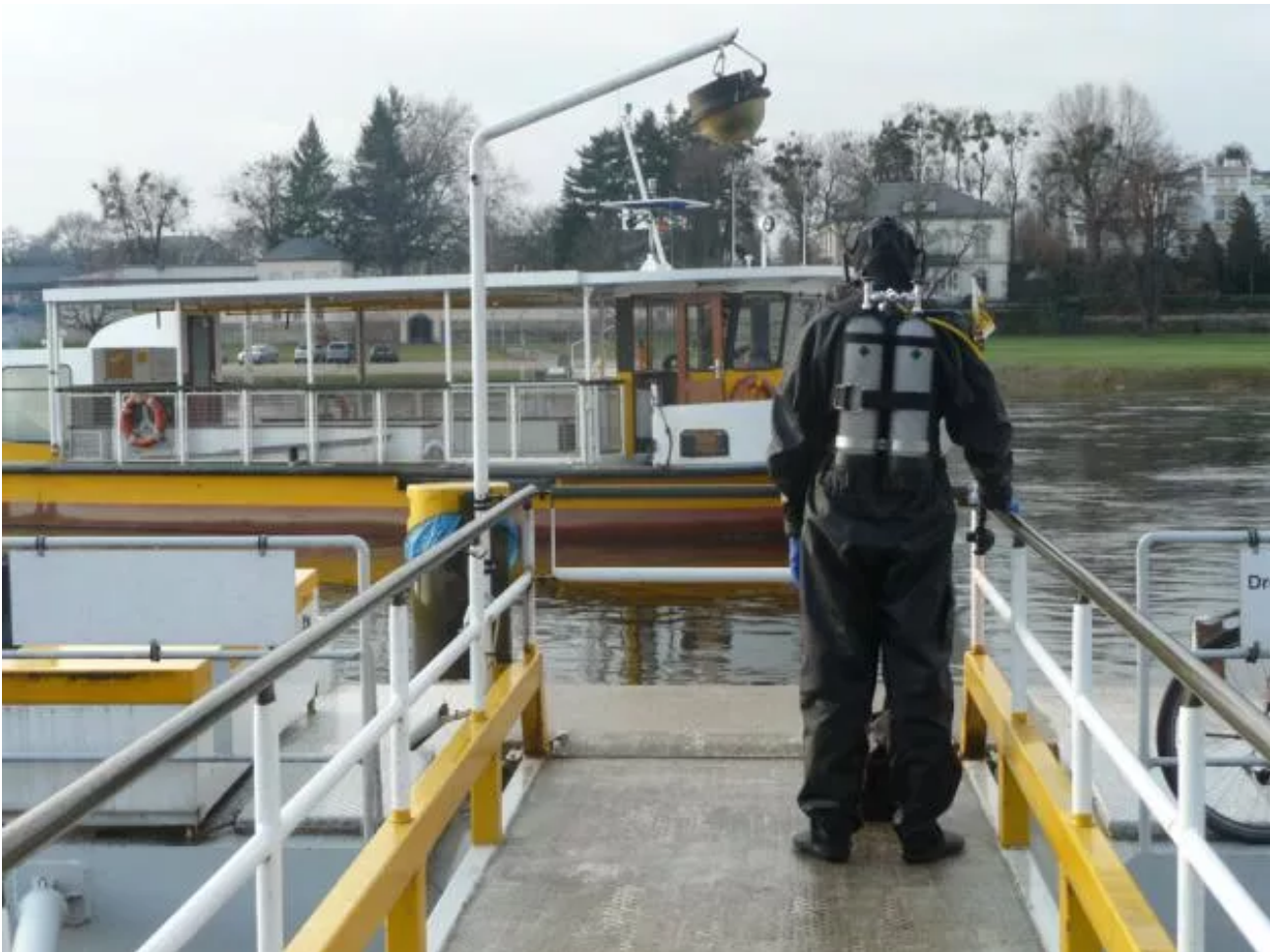
Performance during the opening of the exhibition WAS WIR WOLLEN curated by ff. Konzeptzuaktuellerkunst, Dresden.