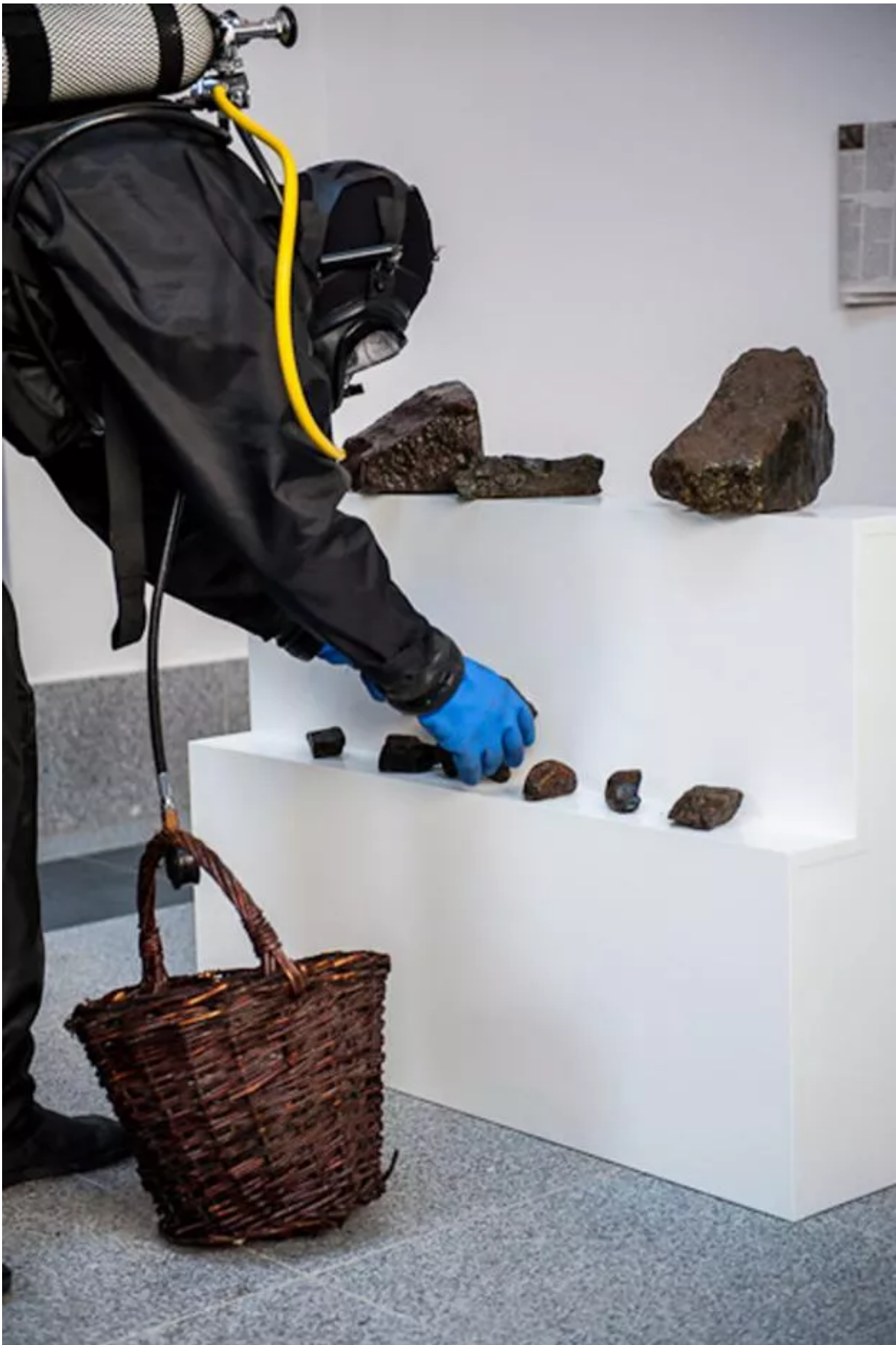
Performance during the opening of the exhibition WAS WIR WOLLEN curated by ff. Konzeptzuaktuellerkunst, Dresden.