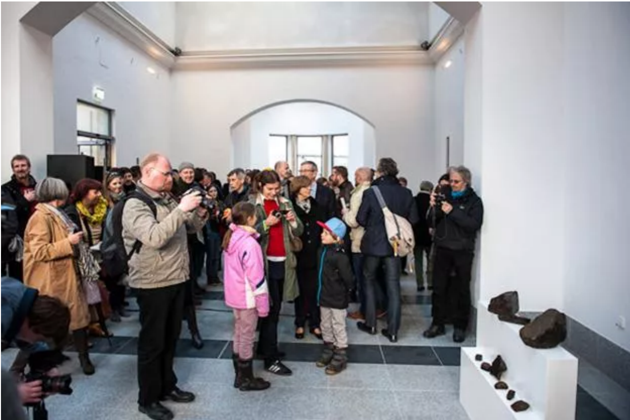
Performance during the opening of the exhibition WAS WIR WOLLEN curated by ff. Konzeptzuaktuellerkunst, Dresden.