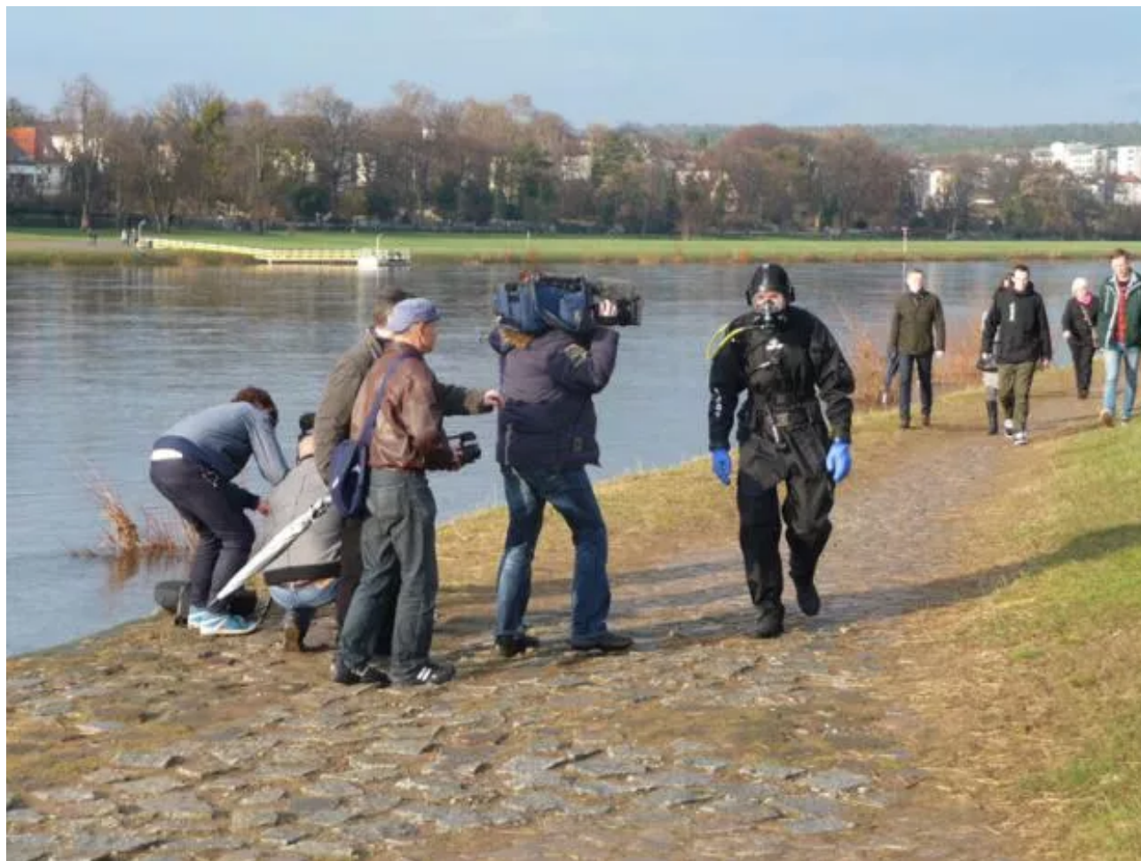
Performance during the opening of the exhibition WAS WIR WOLLEN curated by ff. Konzeptzuaktuellerkunst, Dresden.

A professional frogman searching, collecting and presenting plausible evidence in order to establish the extra-artistic value and legitimacy of found objects.