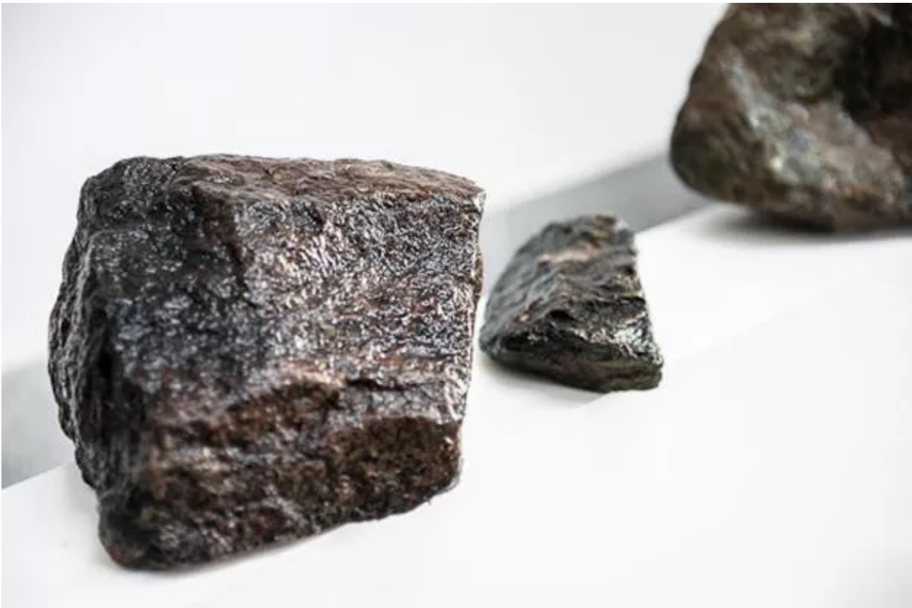
Performance during the opening of the exhibition WAS WIR WOLLEN curated by ff. Konzeptzuaktuellerkunst, Dresden.