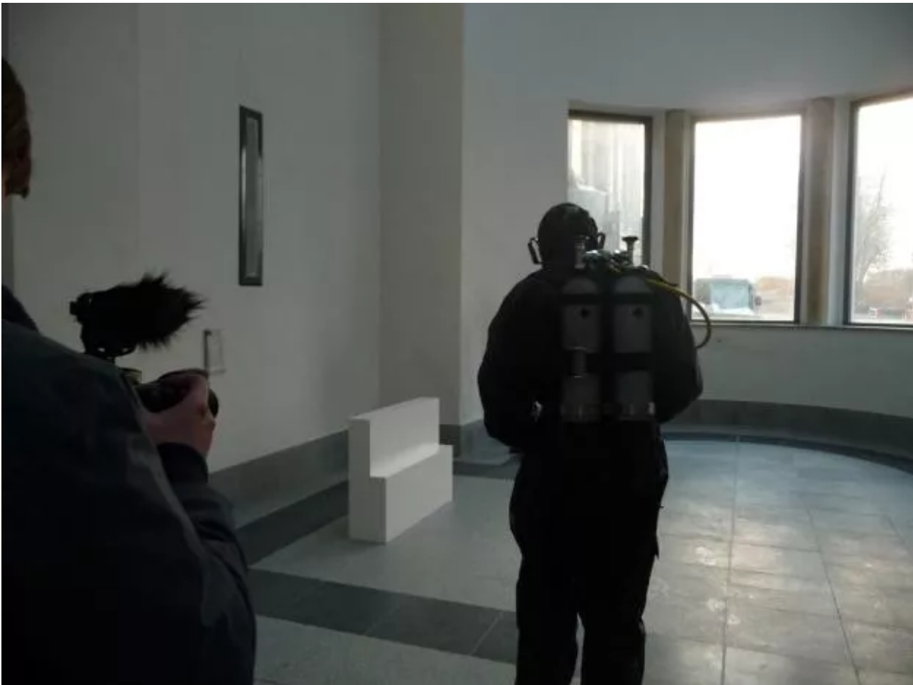
Performance during the opening of the exhibition WAS WIR WOLLEN curated by ff. Konzeptzuaktuellerkunst, Dresden.