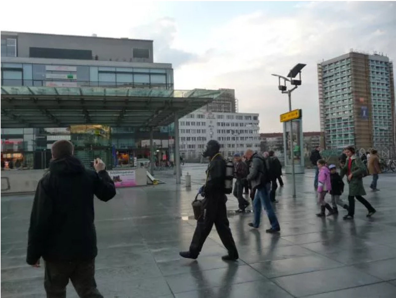
Performance during the opening of the exhibition WAS WIR WOLLEN curated by ff. Konzeptzuaktuellerkunst, Dresden.