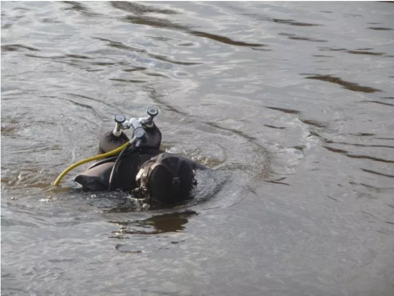
Performance during the opening of the exhibition WAS WIR WOLLEN curated by ff. Konzeptzuaktuellerkunst, Dresden.