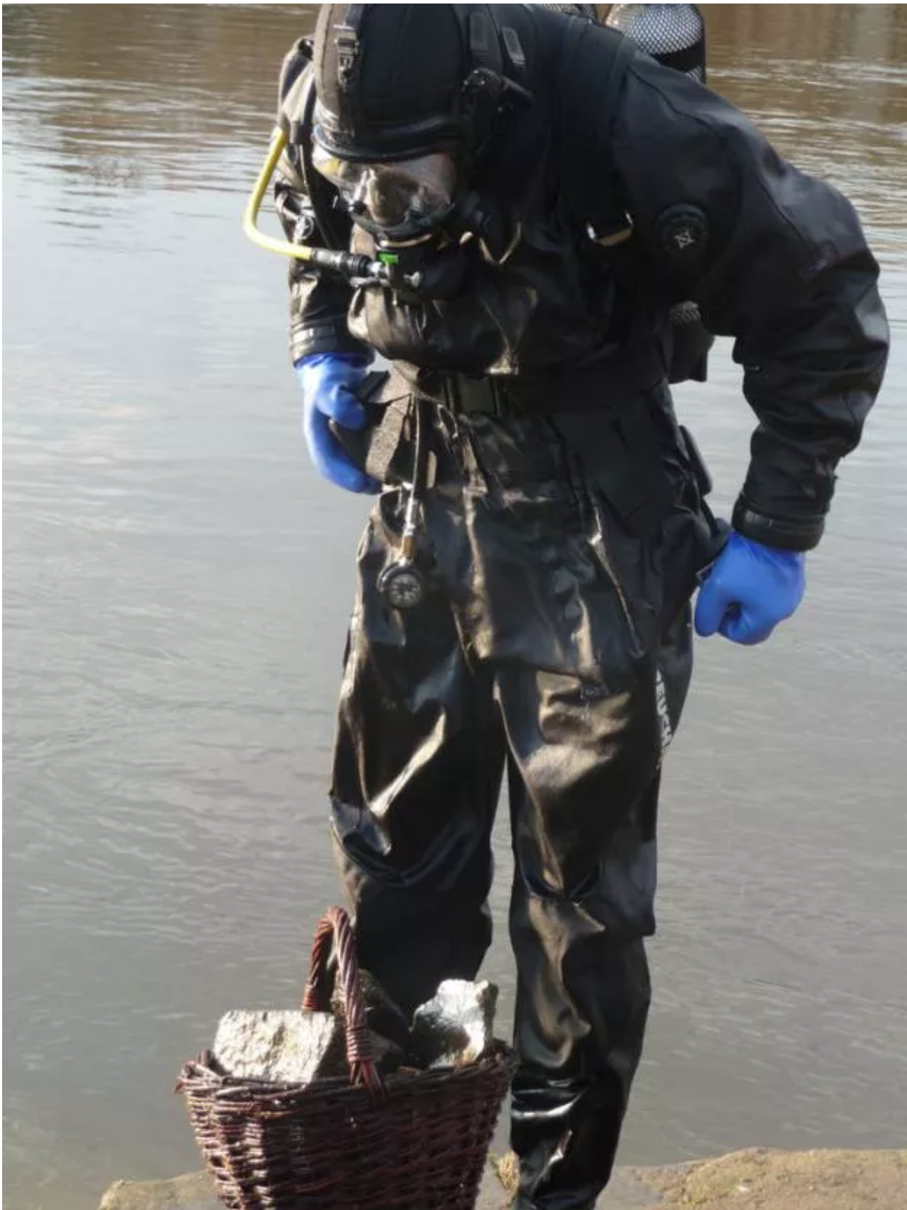
Performance during the opening of the exhibition WAS WIR WOLLEN curated by ff. Konzeptzuaktuellerkunst, Dresden.