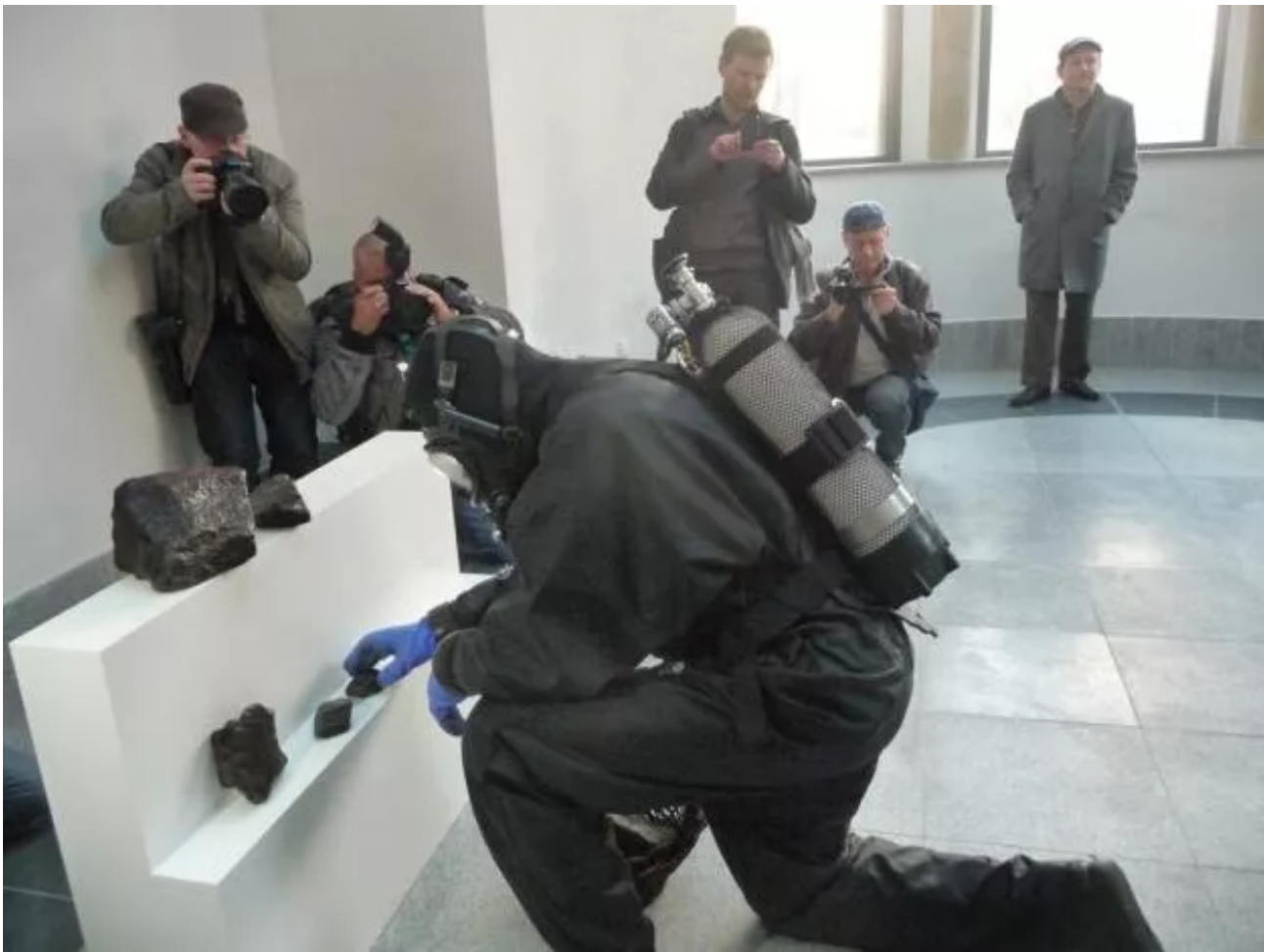
Performance during the opening of the exhibition WAS WIR WOLLEN curated by ff. Konzeptzuaktuellerkunst, Dresden.