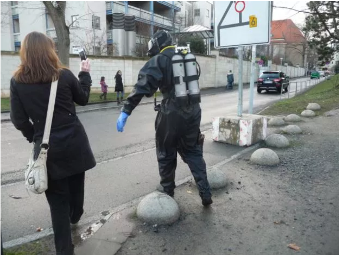
Performance during the opening of the exhibition WAS WIR WOLLEN curated by ff. Konzeptzuaktuellerkunst, Dresden.