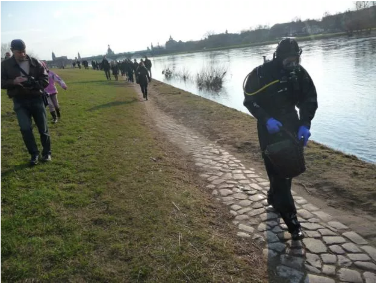
Performance during the opening of the exhibition WAS WIR WOLLEN curated by ff. Konzeptzuaktuellerkunst, Dresden.