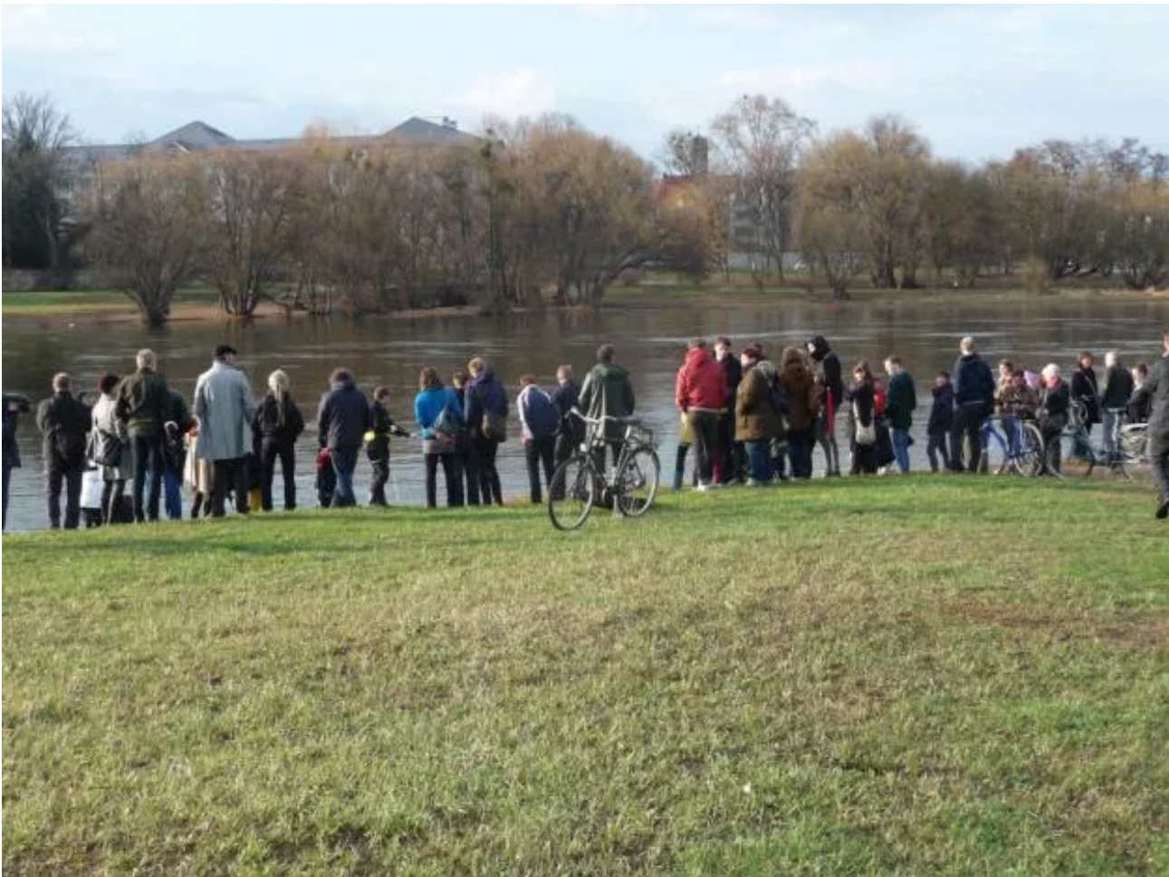
Performance during the opening of the exhibition WAS WIR WOLLEN curated by ff. Konzeptzuaktuellerkunst, Dresden.