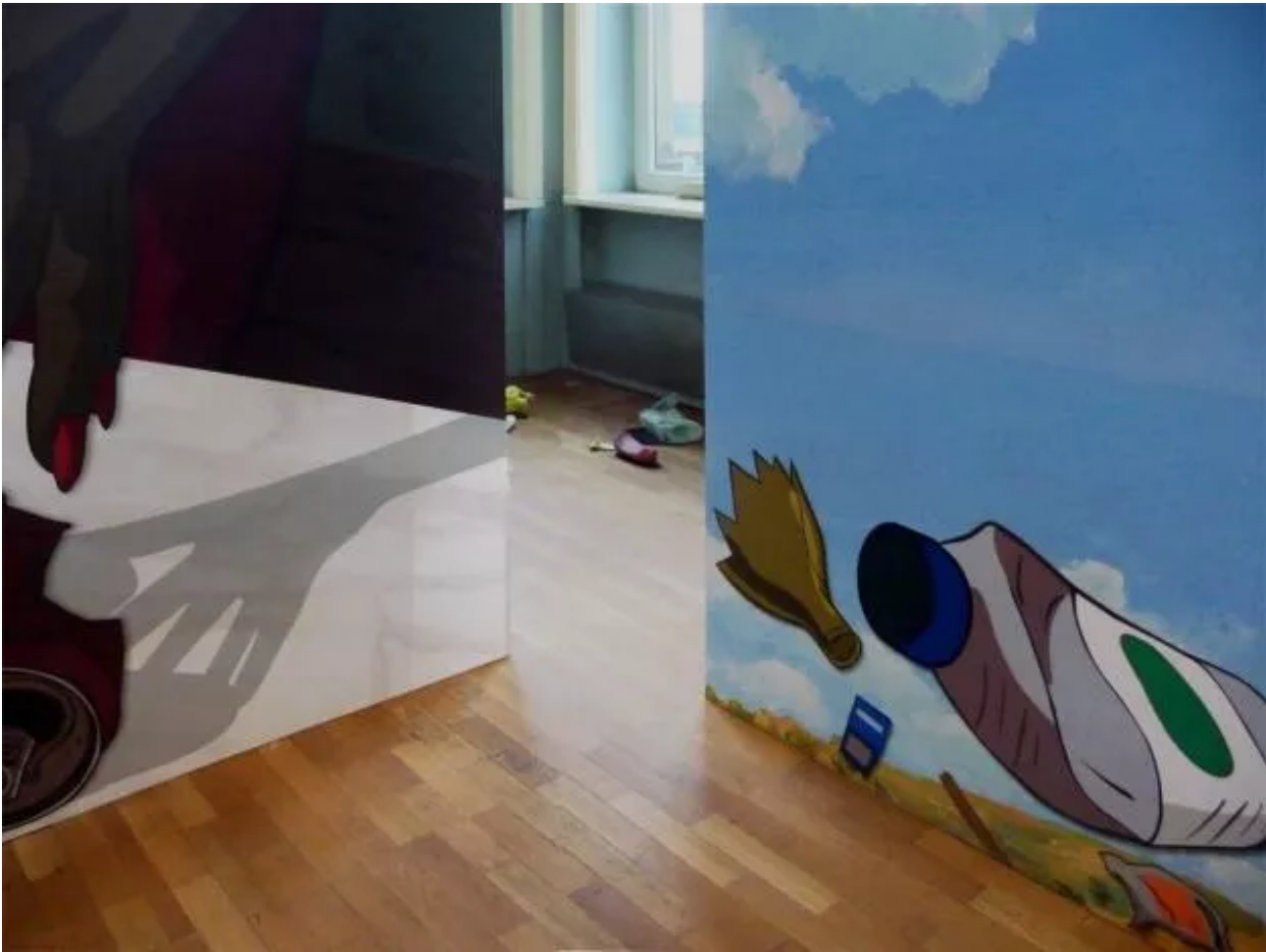
Exhibition view at Casino Luxembourg - Forum d'art contemporain. "Found in Translation", curated by Emmanuel Lambion.