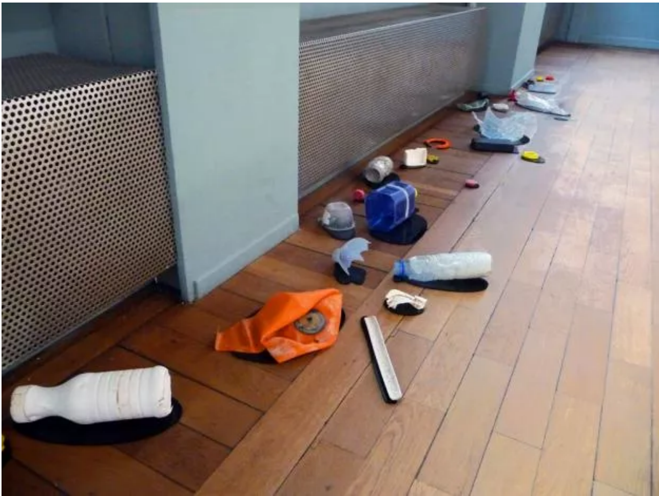
Exhibition view at Casino Luxembourg - Forum d'art contemporain. "Found in Translation", curated by Emmanuel Lambion.