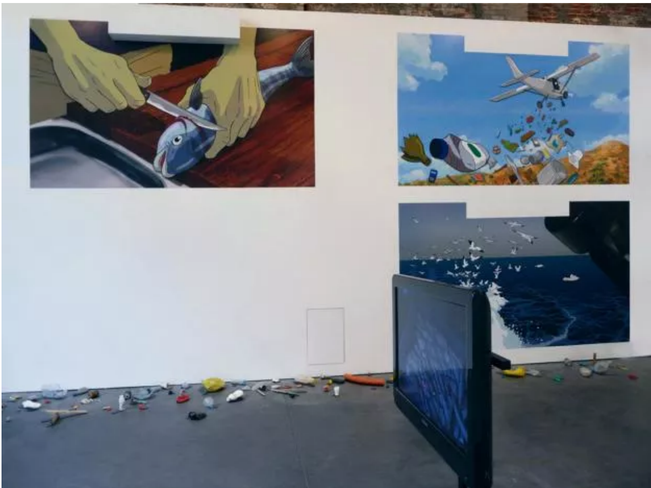
Exhibition view at Aliceday, Brussels.