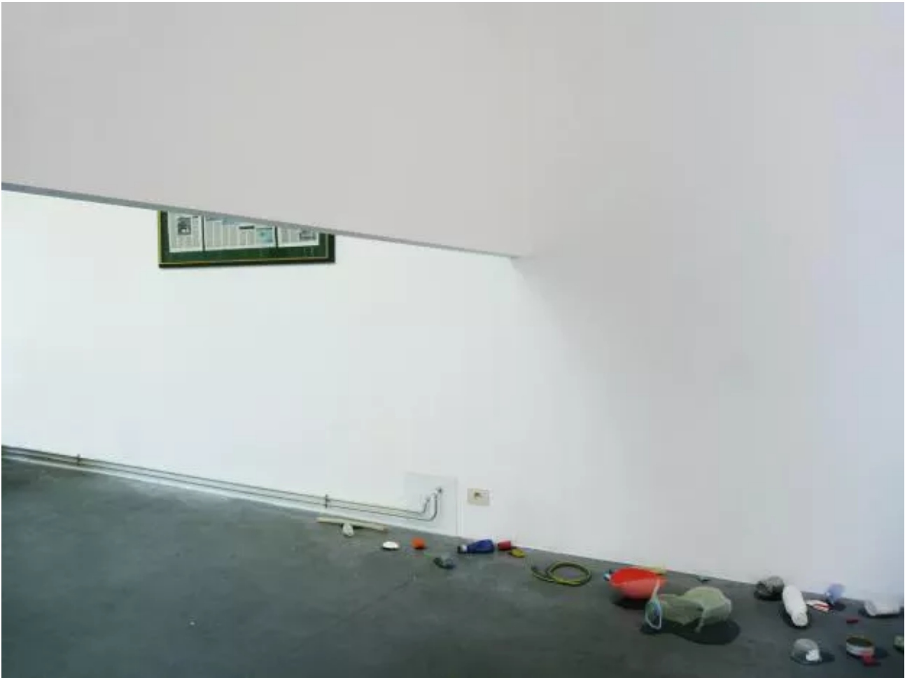
Exhibition view at Aliceday, Brussels.