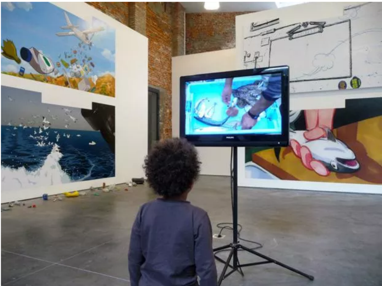
Exhibition view at Aliceday, Brussels.