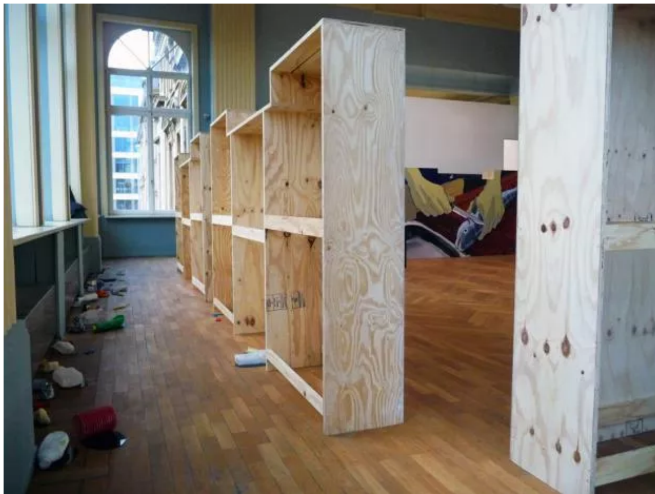
Exhibition view at Casino Luxembourg - Forum d'art contemporain. "Found in Translation", curated by Emmanuel Lambion.

A fish and trash installation displaying multi-stage marvels of cartoon artistry that highlight and activate the incidental symbolism which pervades the humans' inequitable dealings with the sea and its fauna.