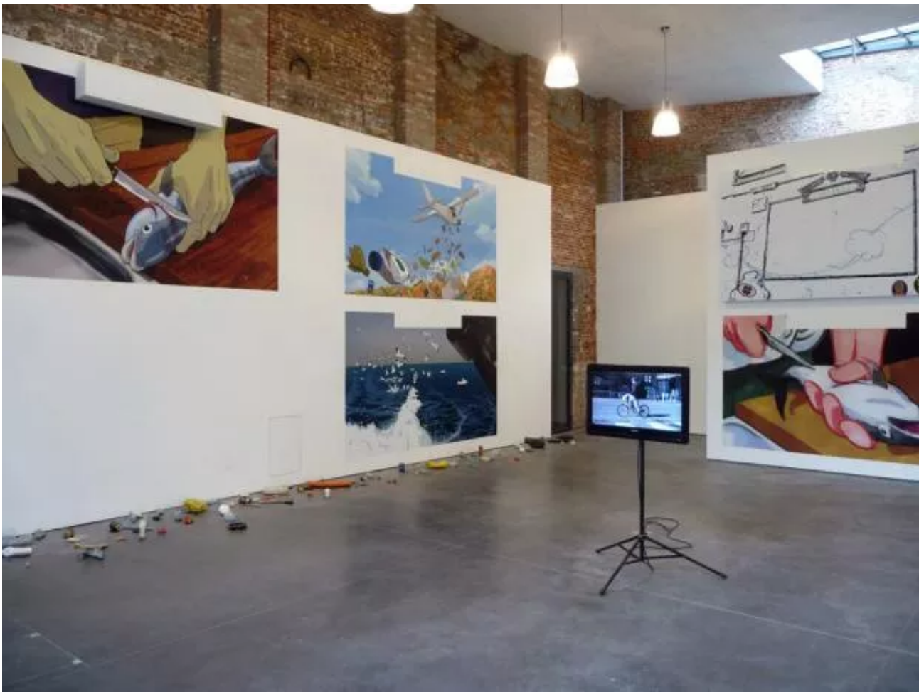
Exhibition view at Aliceday, Brussels.