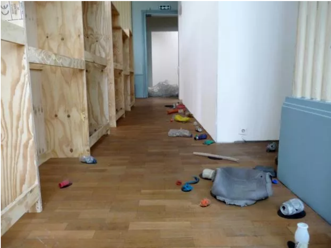
Exhibition view at Casino Luxembourg - Forum d'art contemporain. "Found in Translation", curated by Emmanuel Lambion.