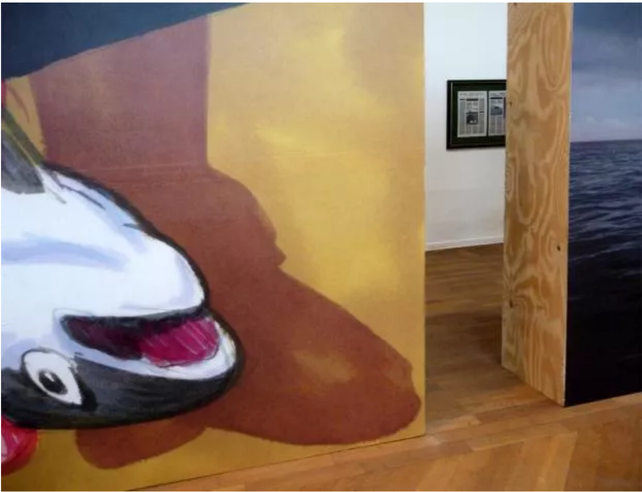
Exhibition view at Casino Luxembourg - Forum d'art contemporain. "Found in Translation", curated by Emmanuel Lambion.