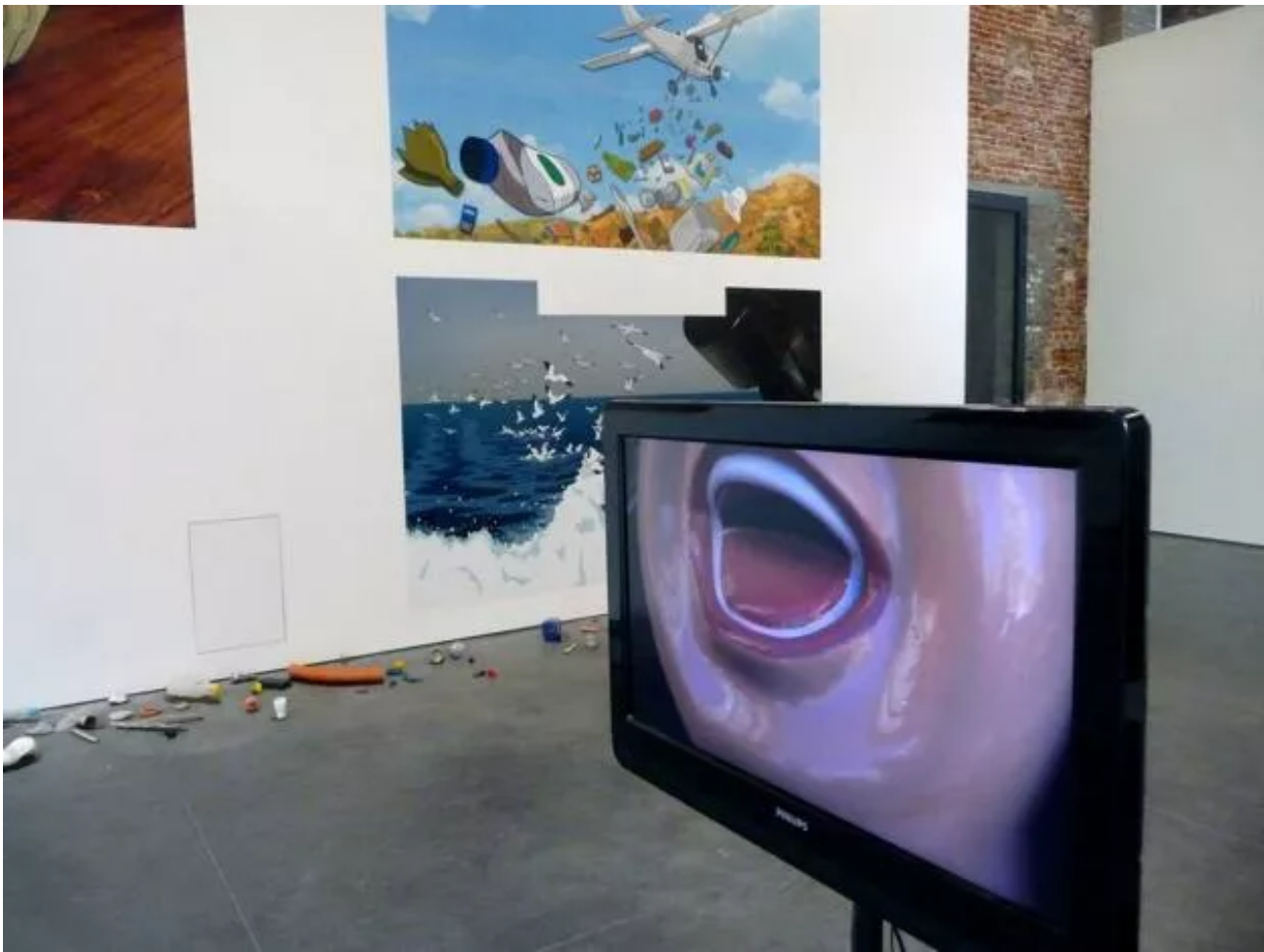
Exhibition view at Aliceday, Brussels.