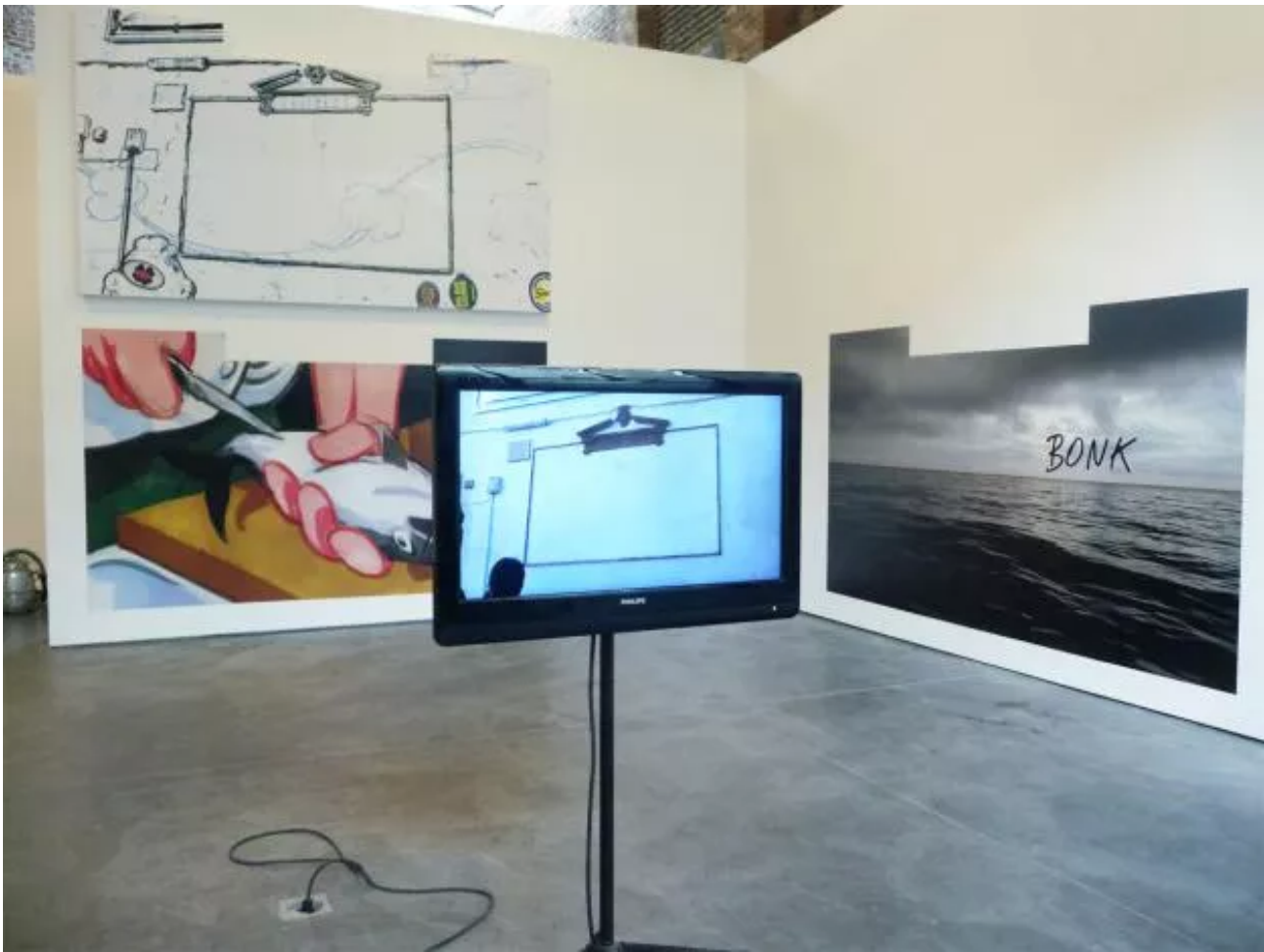
Exhibition view at Aliceday, Brussels.