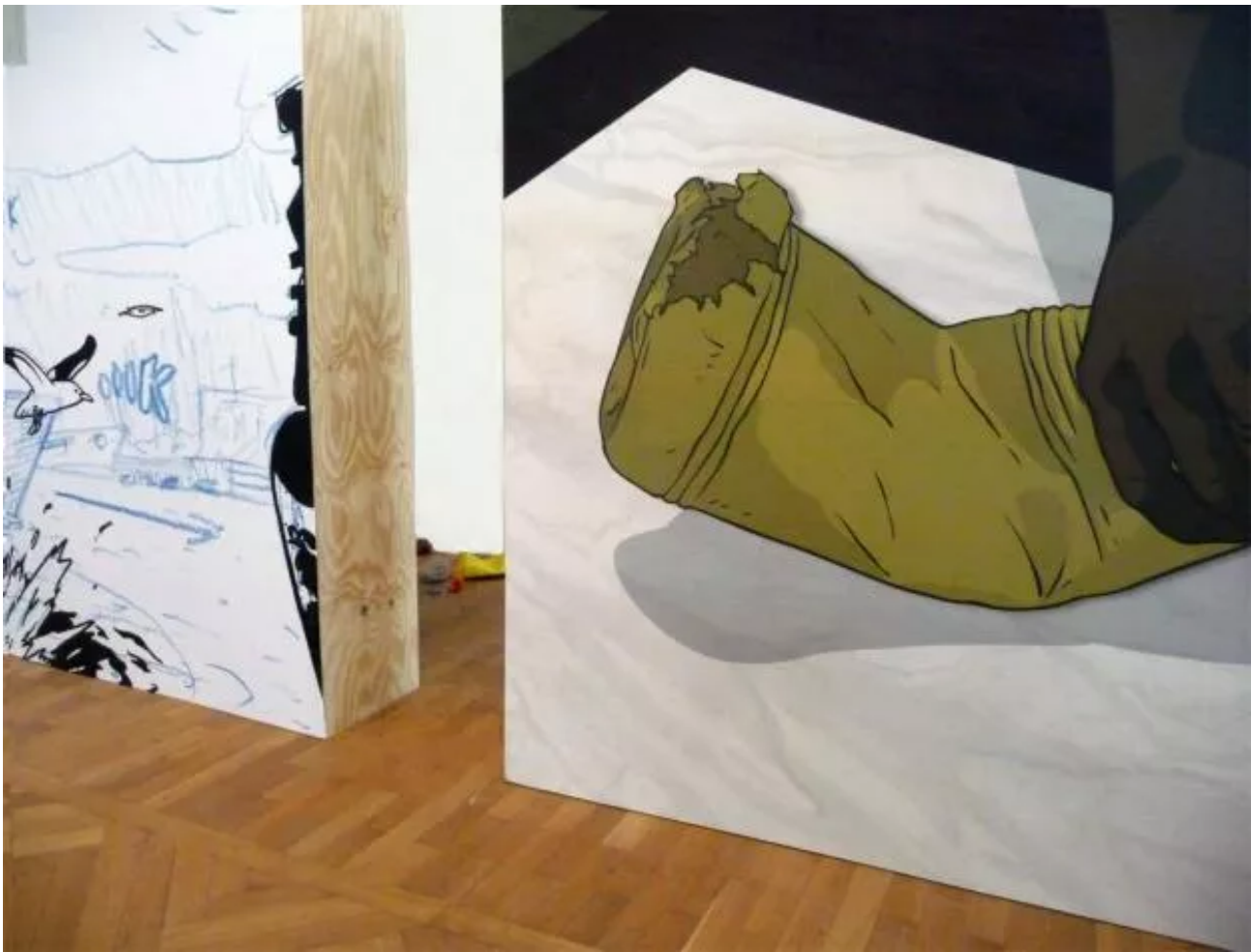
Exhibition view at Casino Luxembourg - Forum d'art contemporain. "Found in Translation", curated by Emmanuel Lambion.