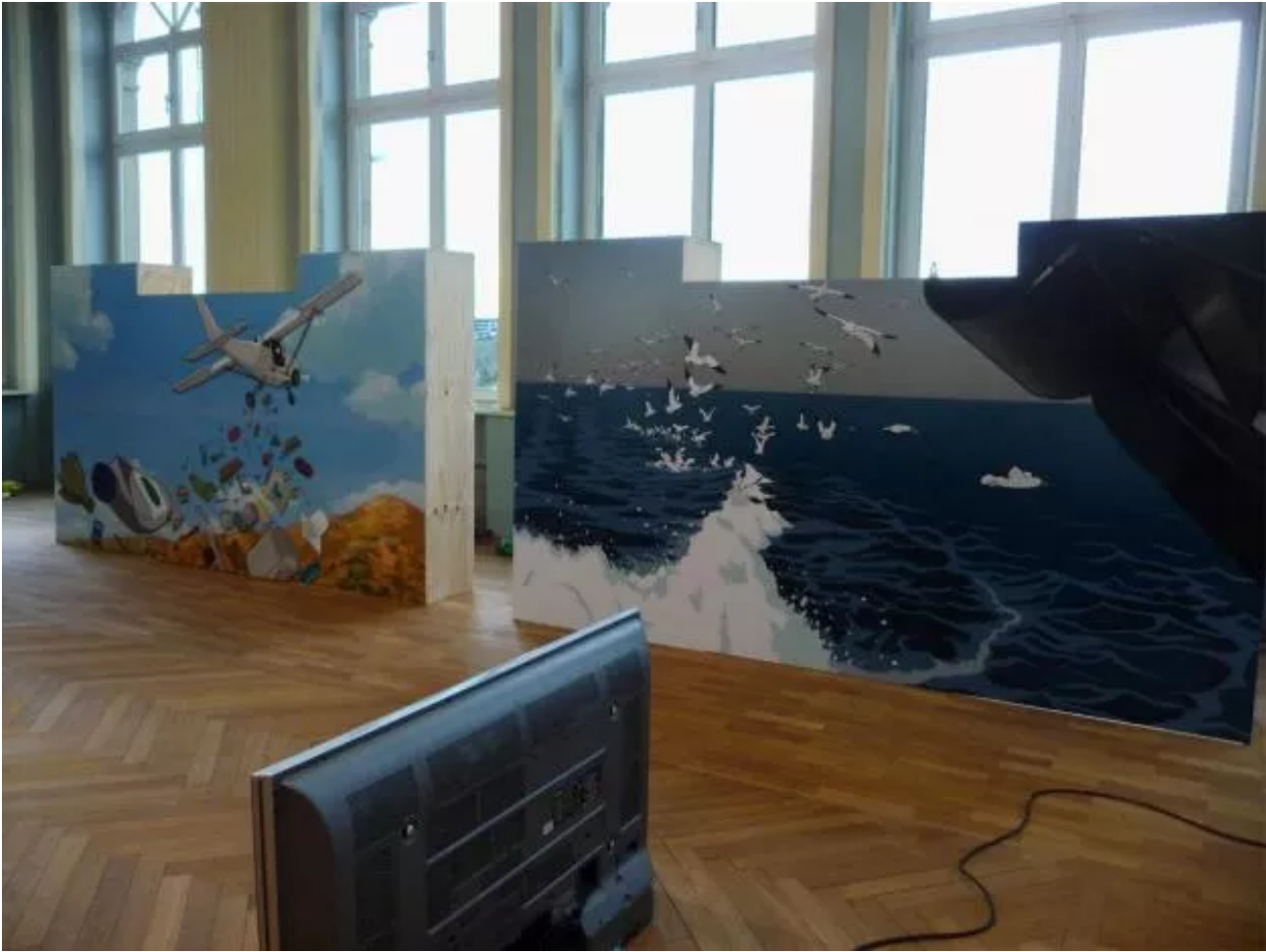
Exhibition view at Casino Luxembourg - Forum d'art contemporain. "Found in Translation", curated by Emmanuel Lambion.