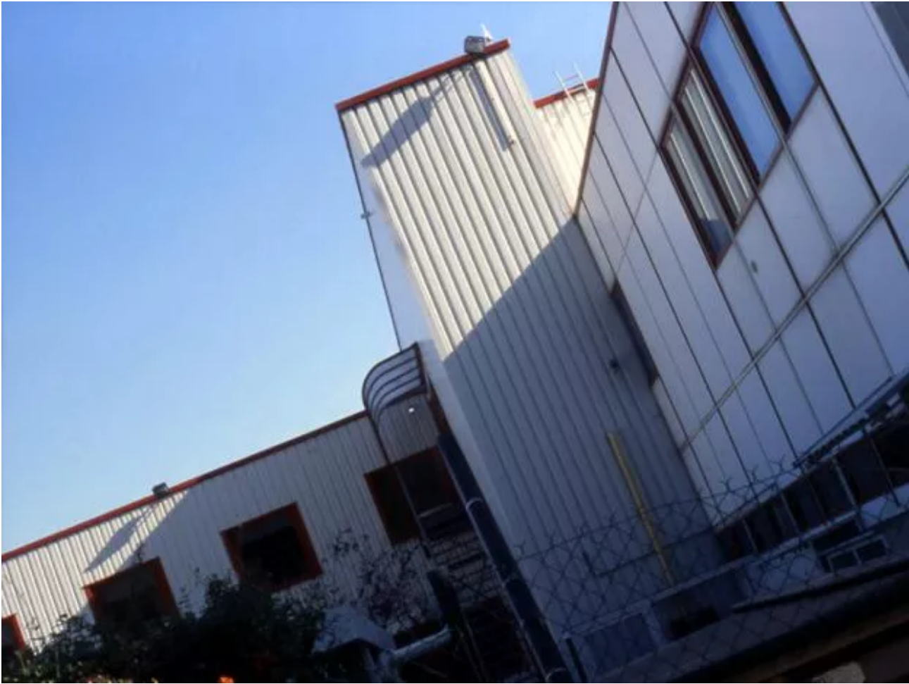
A silent march with black horses, miming a cycle of defecation and renewal in the face of Europe's depleted pockets of industrial activity.