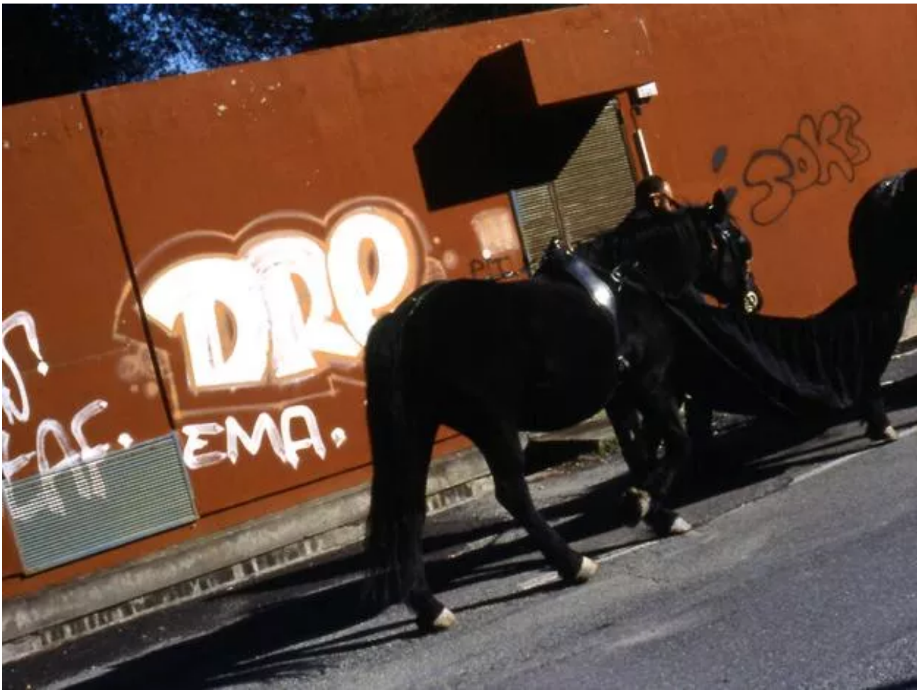
A silent march with black horses, miming a cycle of defecation and renewal in the face of Europe's depleted pockets of industrial activity.