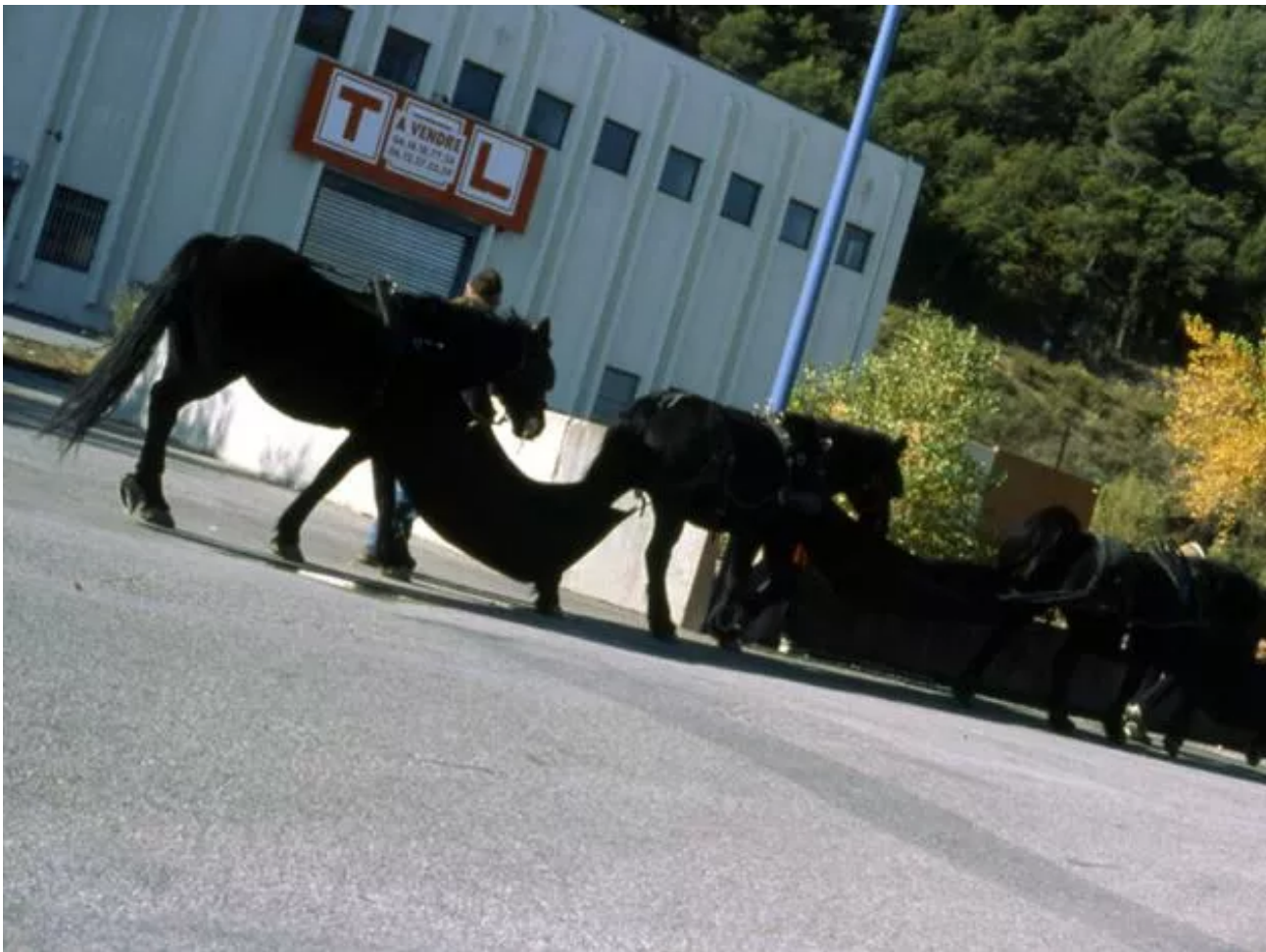
A silent march with black horses, miming a cycle of defecation and renewal in the face of Europe's depleted pockets of industrial activity.