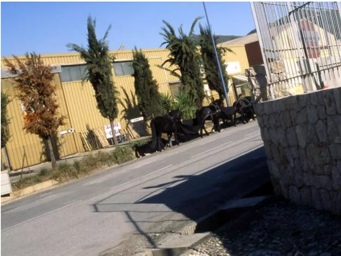
A silent march with black horses, miming a cycle of defecation and renewal in the face of Europe's depleted pockets of industrial activity.