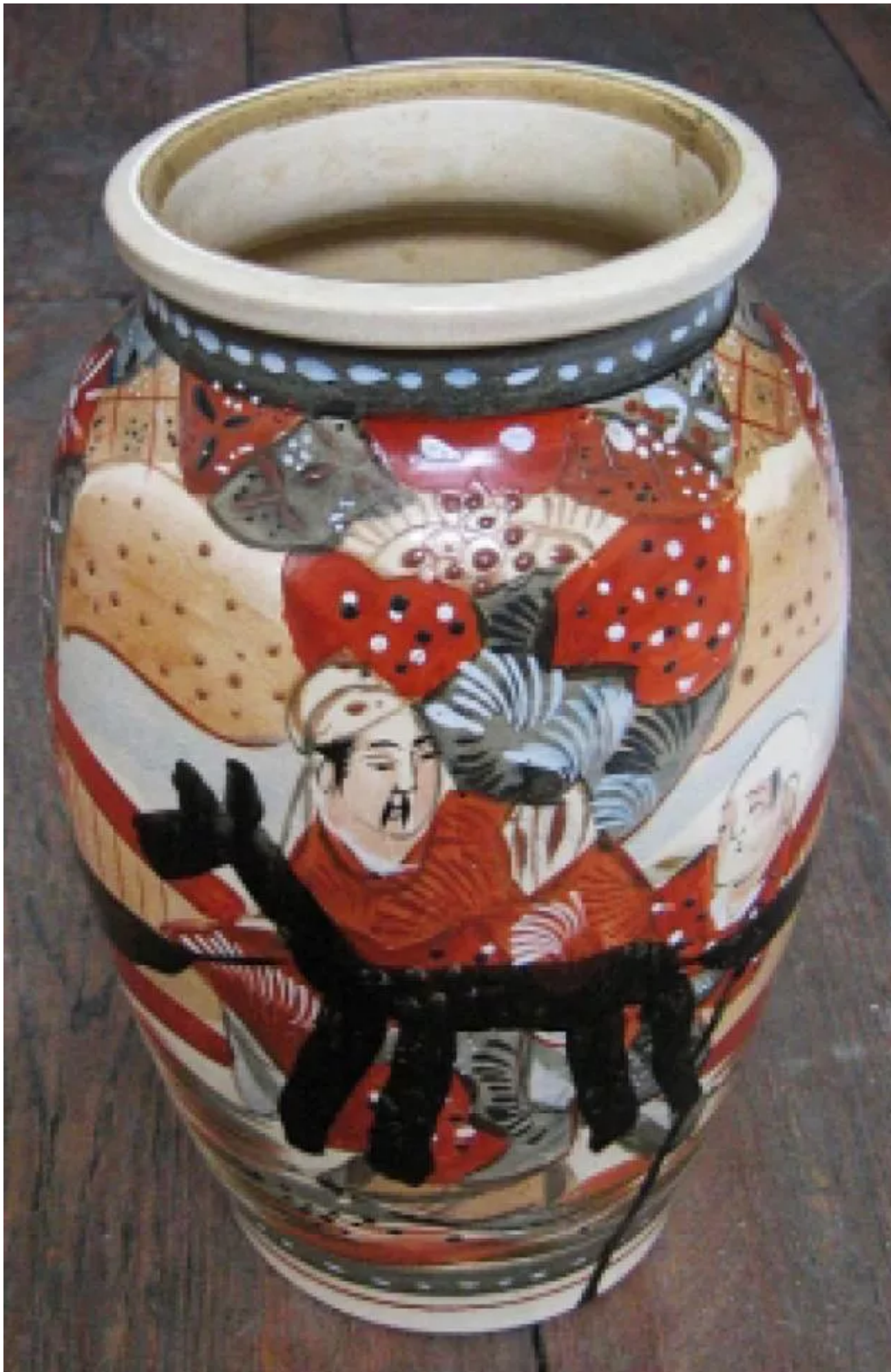
A silent march with black horses, miming a cycle of defecation and renewal in the face of Europe's depleted pockets of industrial activity.