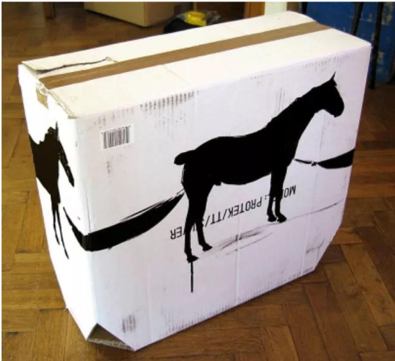
A silent march with black horses, miming a cycle of defecation and renewal in the face of Europe's depleted pockets of industrial activity.