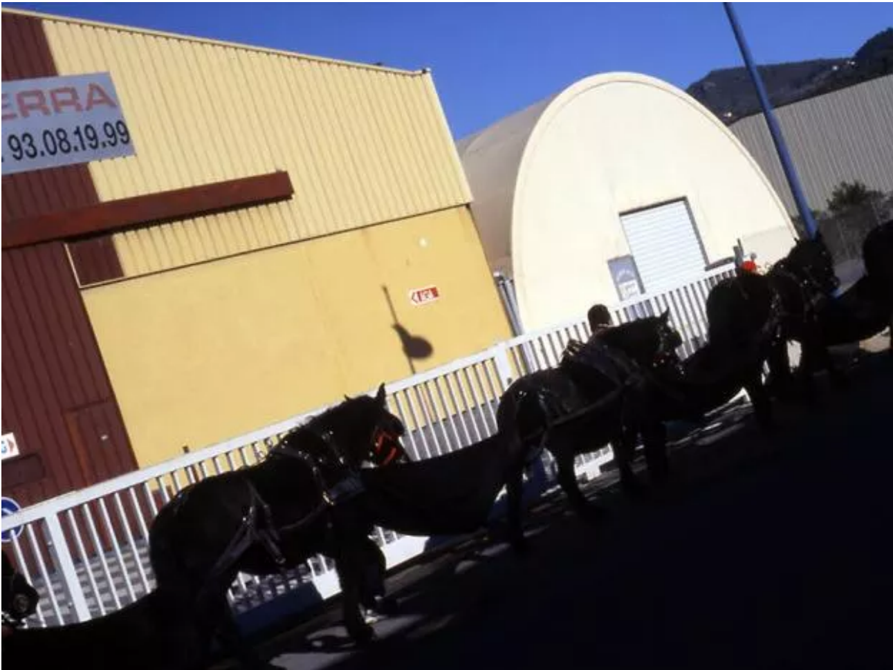
A silent march with black horses, miming a cycle of defecation and renewal in the face of Europe's depleted pockets of industrial activity.