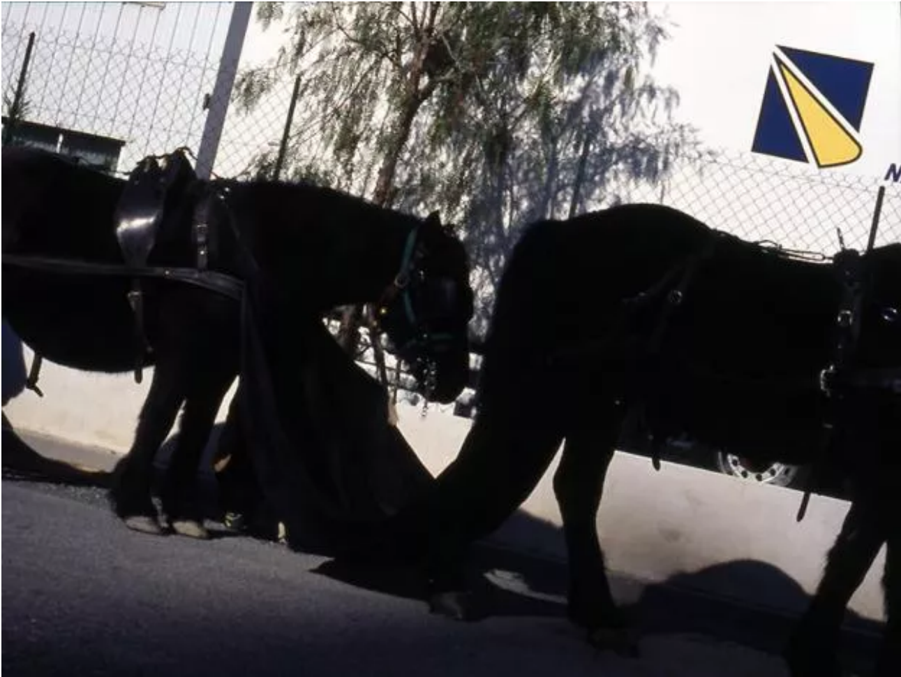
A silent march with black horses, miming a cycle of defecation and renewal in the face of Europe's depleted pockets of industrial activity.