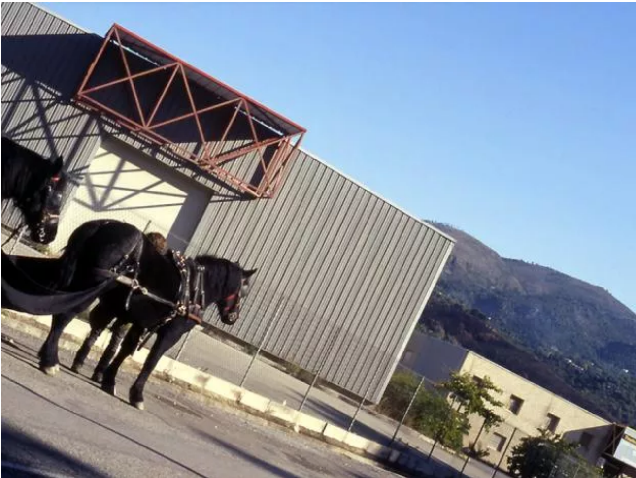
A silent march with black horses, miming a cycle of defecation and renewal in the face of Europe's depleted pockets of industrial activity.