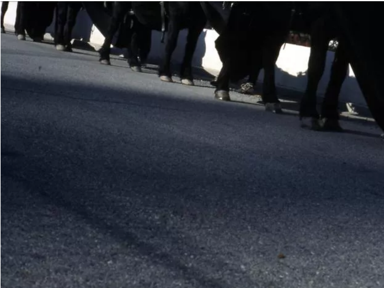
A silent march with black horses, miming a cycle of defecation and renewal in the face of Europe's depleted pockets of industrial activity.