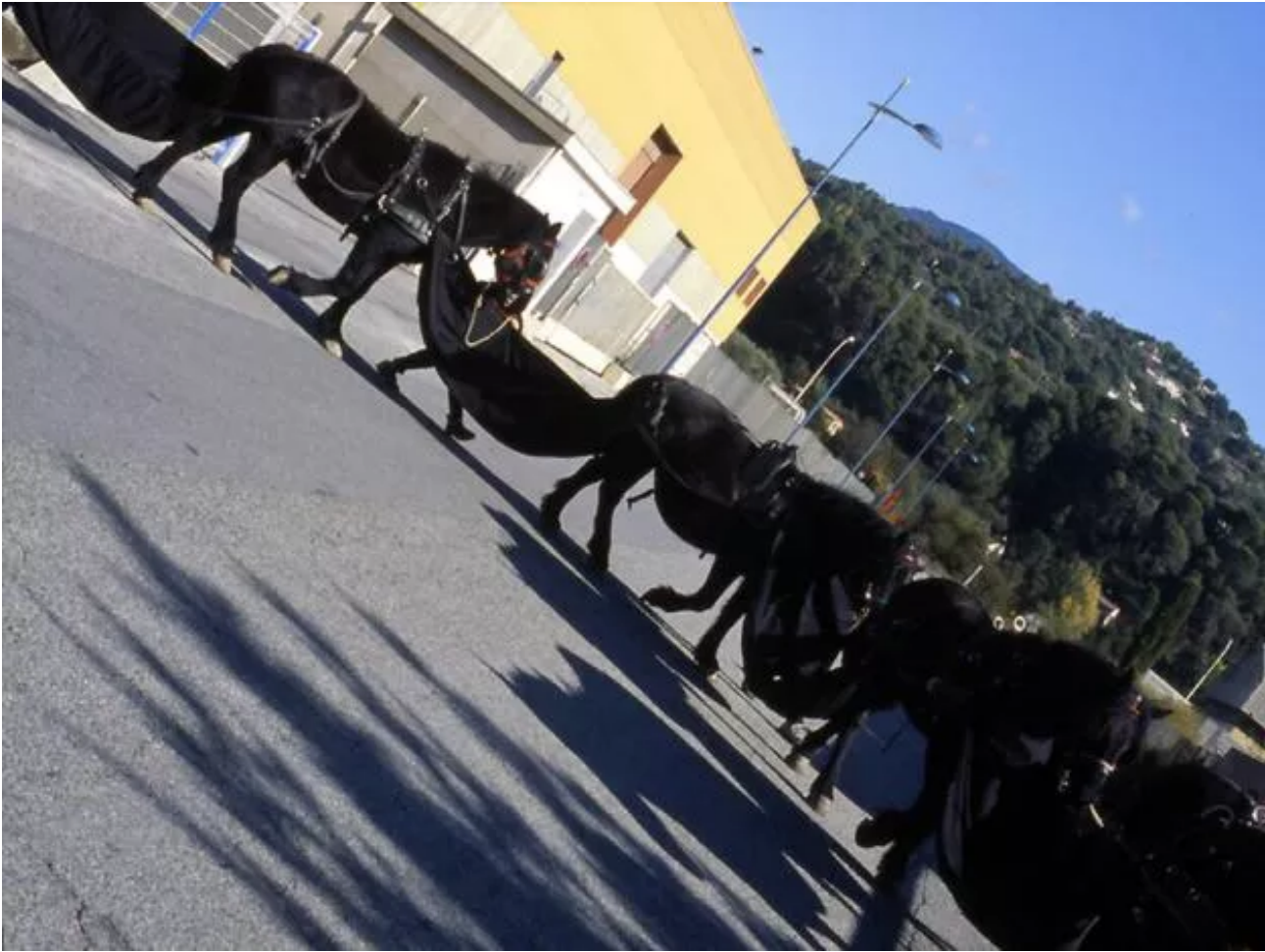
A silent march with black horses, miming a cycle of defecation and renewal in the face of Europe's depleted pockets of industrial activity.