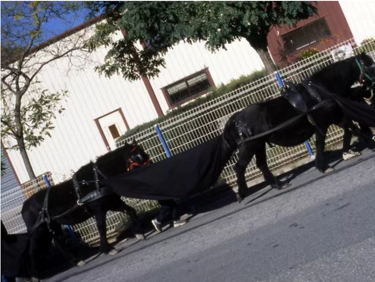
A silent march with black horses, miming a cycle of defecation and renewal in the face of Europe's depleted pockets of industrial activity.