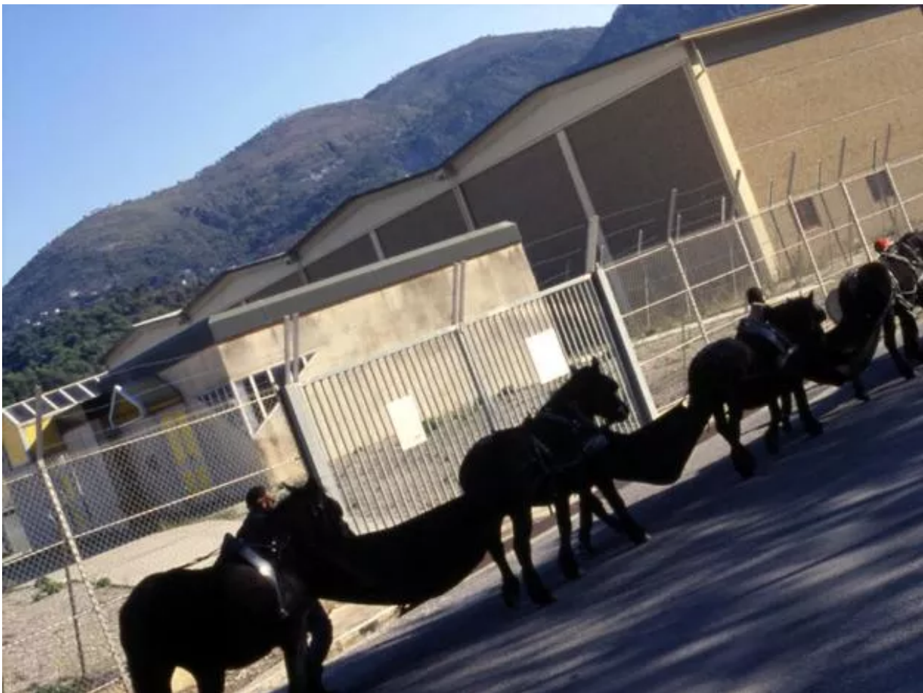
A silent march with black horses, miming a cycle of defecation and renewal in the face of Europe's depleted pockets of industrial activity.