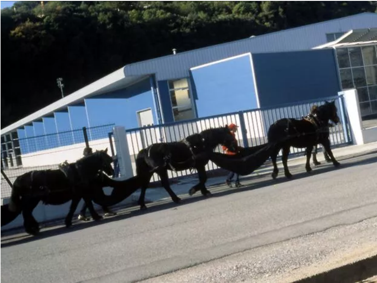
A silent march with black horses, miming a cycle of defecation and renewal in the face of Europe's depleted pockets of industrial activity.