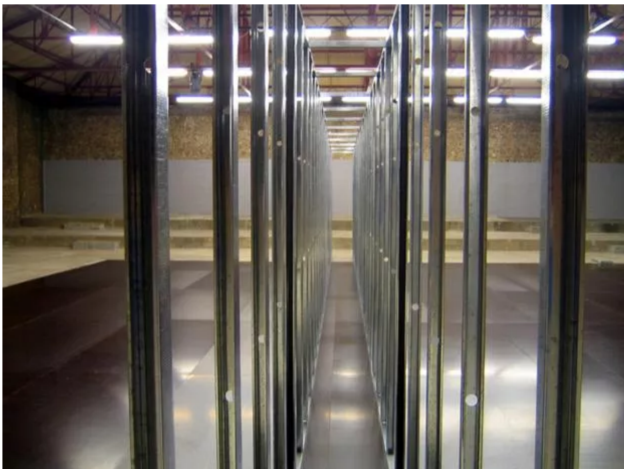
Exhibition view. Le Blac, Brussels, 2005.

Metal structure usually set up to construct plaster walls, flanked by the alleged storyboard of its realization. But the person on the storyboard photographs, however, is a male model who performs his real job (posing) while imitating an exhibition technician.