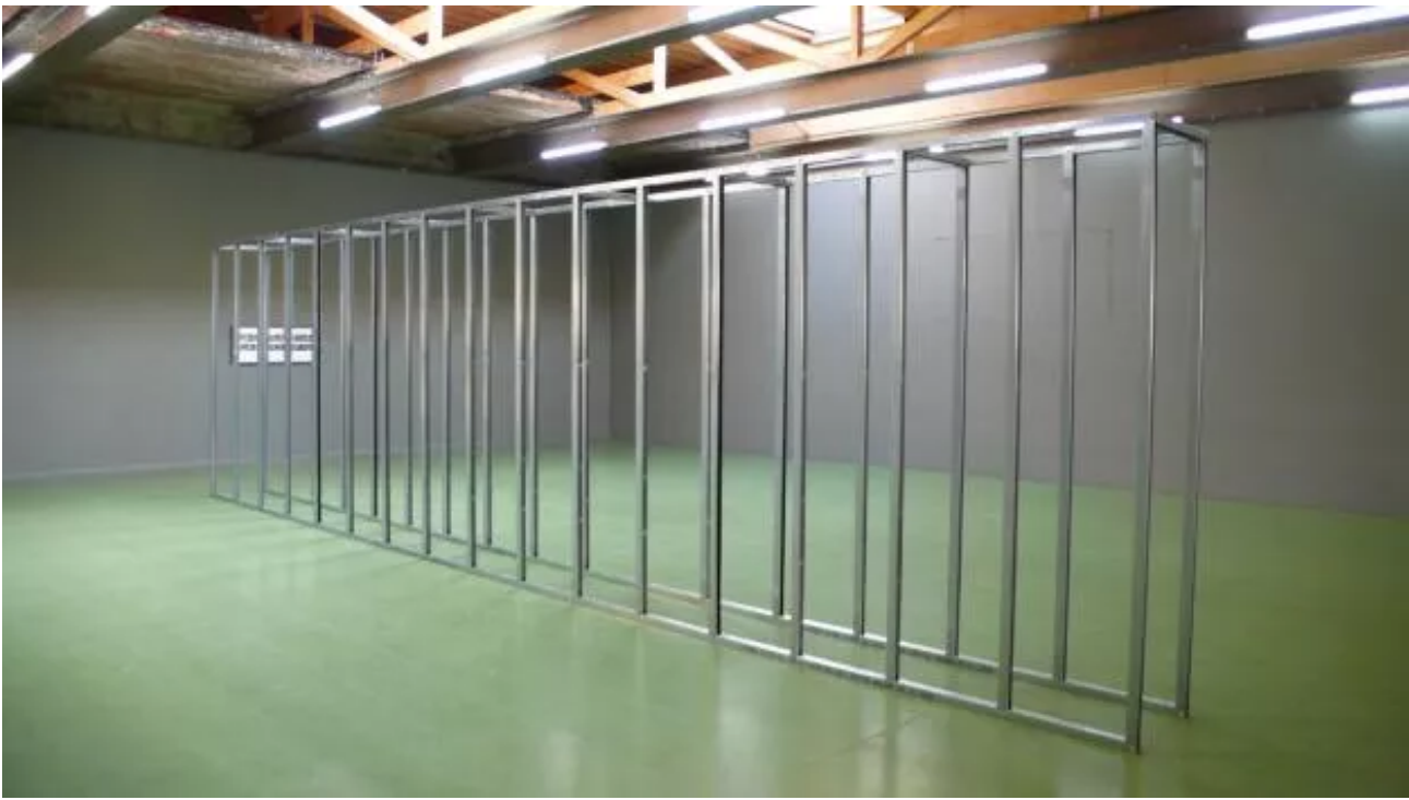
Exhibition view. Netwerk , Aalst, 2008.