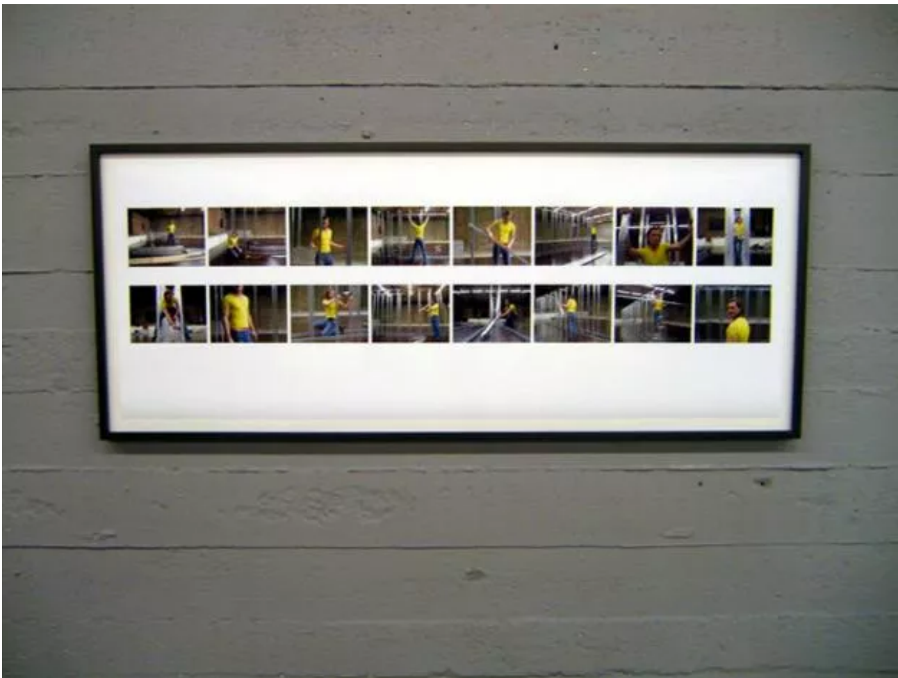
Exhibition view. Detail, storyboard. Le Blac, Brussels, 2005.