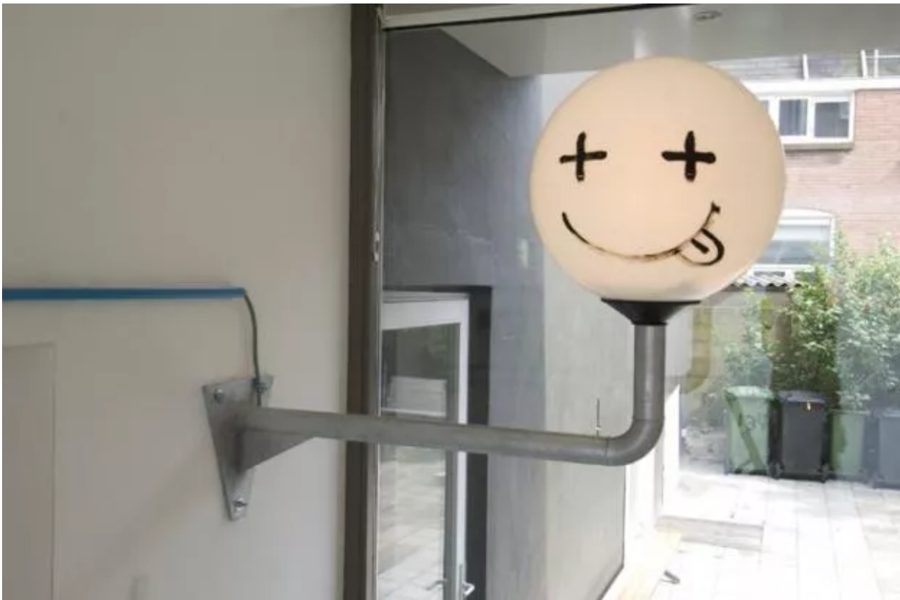
exhibition view / group exhibition "Faire et défaire c'est toujours travailler", curated by Le Commissariat, galerie West, Den Haag, 2008.