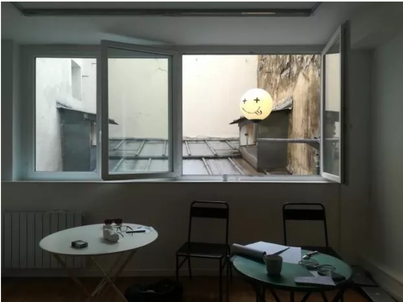
exhibition view / group exhibition 'Club Andalouse', Paris - curated by Marie de Gaulejac, 2017.