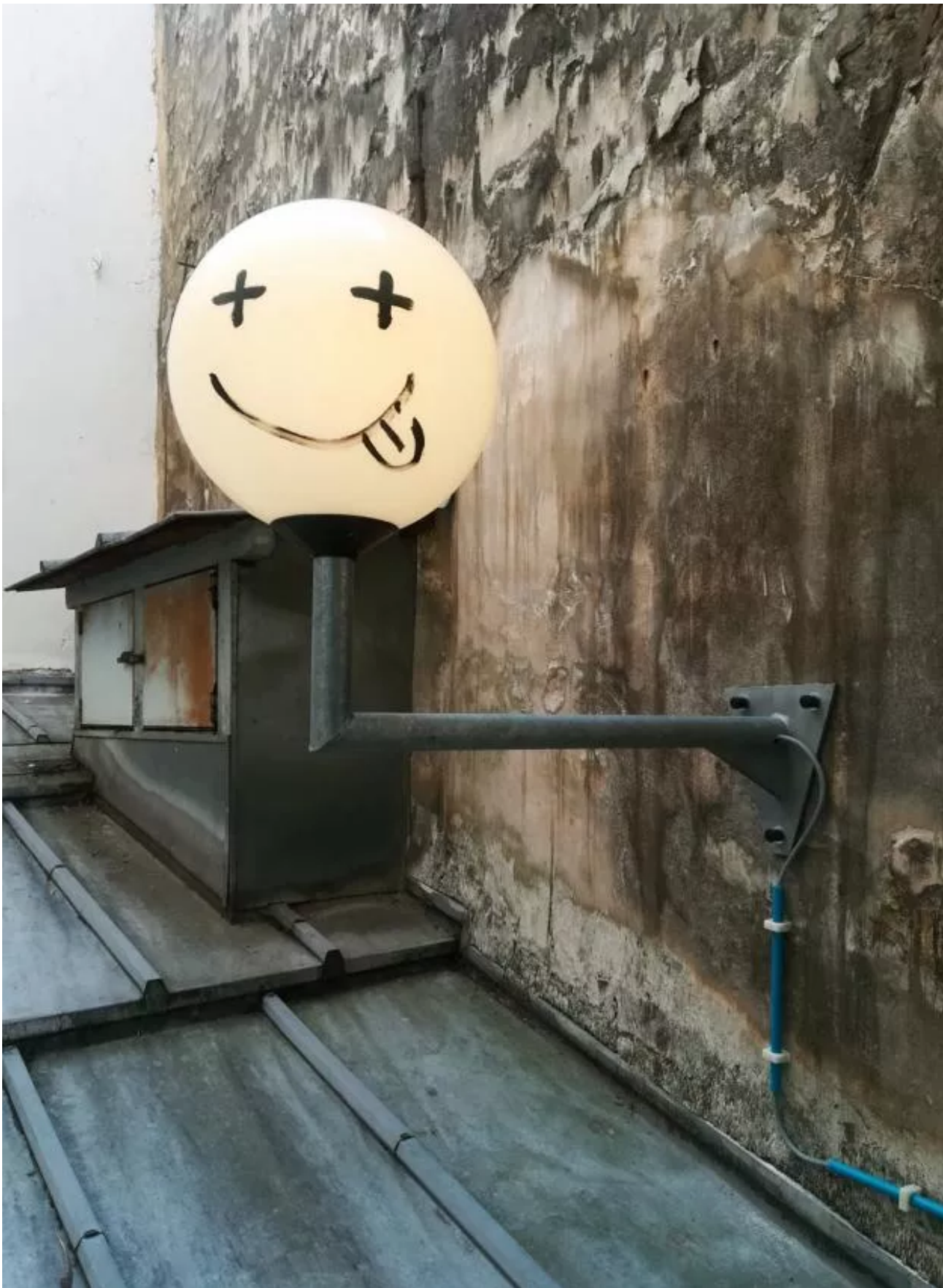
exhibition view / group exhibition 'Club Andalouse', Paris - curated by Marie de Gaulejac, 2017.