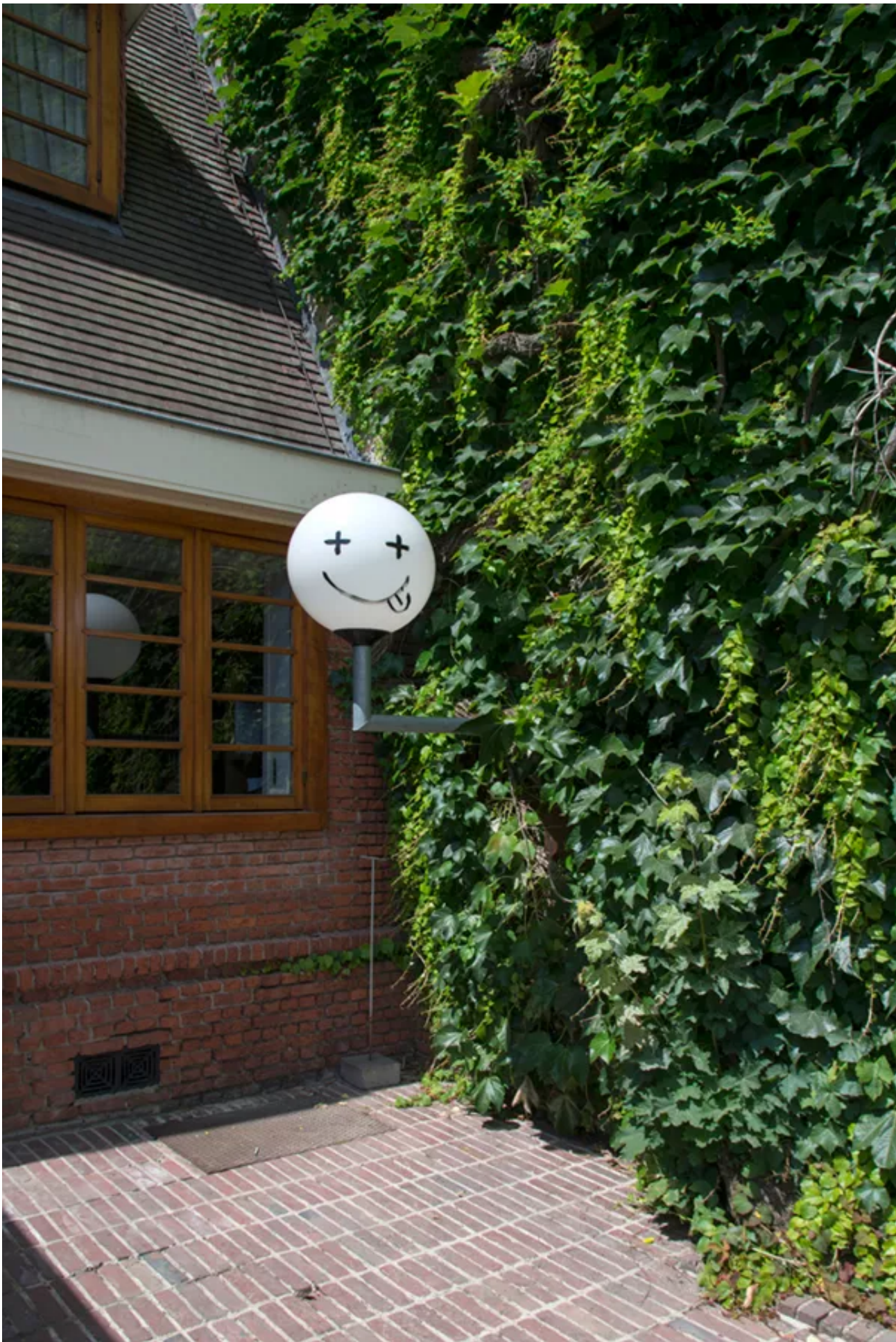
exhibition view / group exhibition 'Present', Van Buren Museum, Bruxelles - curated by Michel Van Dyck, 2018.