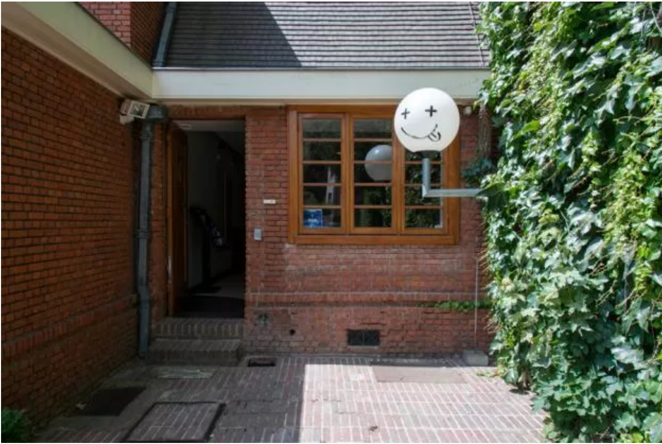
exhibition view / group exhibition 'Present', Van Buren Museum, Bruxelles - curated by Michel Van Dyck, 2018.