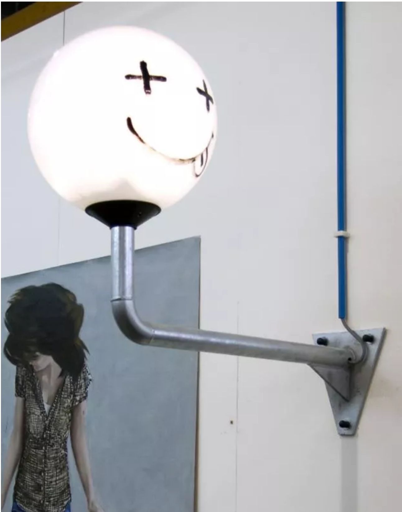
Unlimited edition. Streetlamp (100 x 70 cm), ball (50 cm diameter), silkscreen ink. In the background a painting by Charlotte Beaudry.